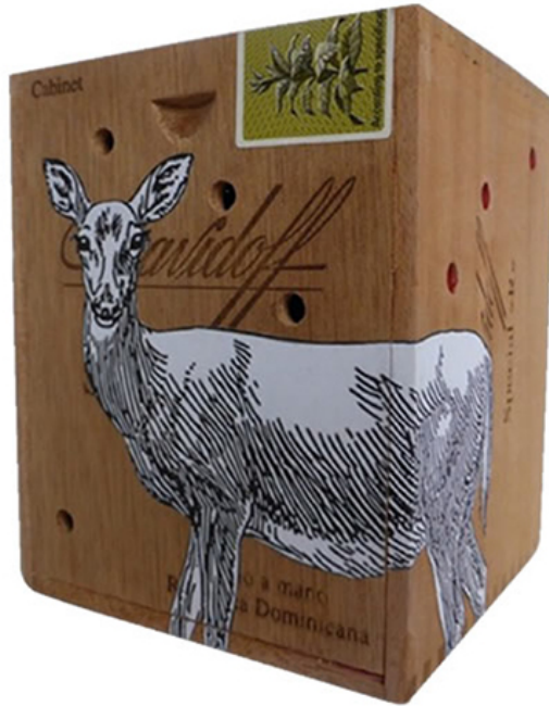
“Damn Deer” by Jane Parkes.

To see some of the boxes up for auction, view our slideshow: