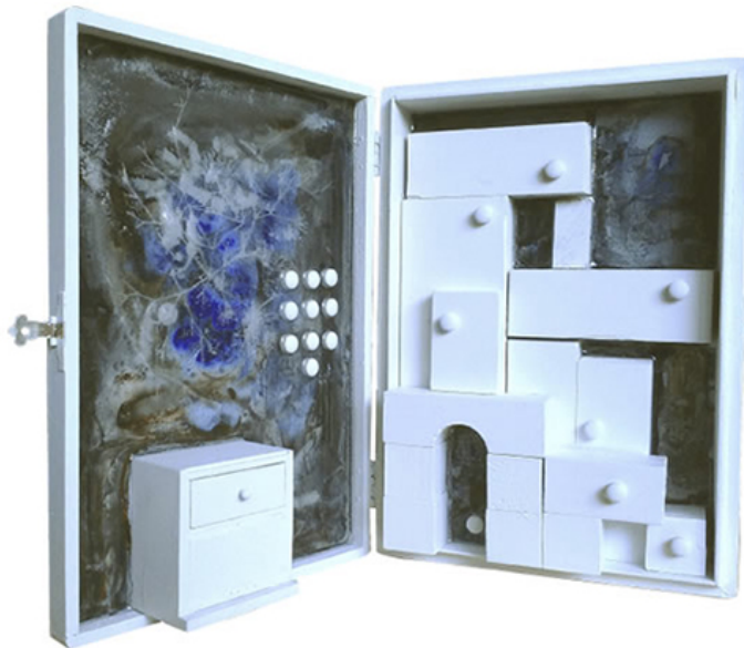
"MemoryPalace (The Strangest Dream" by Darlene Charneco.