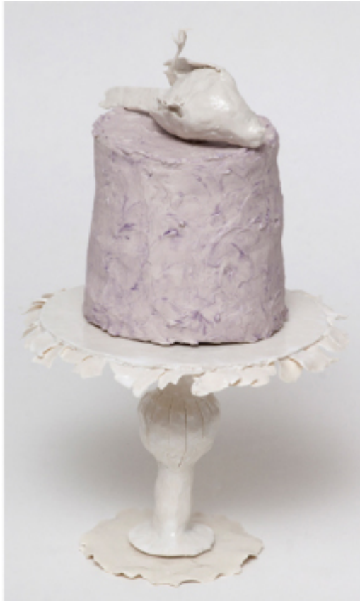
"Tribute" by Monica Banks. Porcelain, 10 1/4 x 7 x 7 inches.