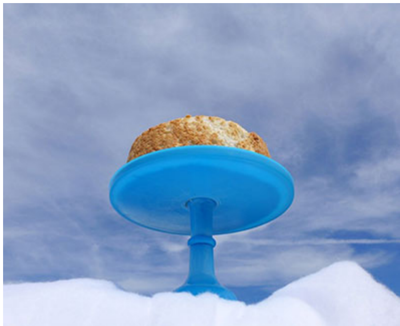
"Sky Cake (Angel Food)" by Christa Maiwald. Archival pigment print, 16 x 20 inches. edition 5.