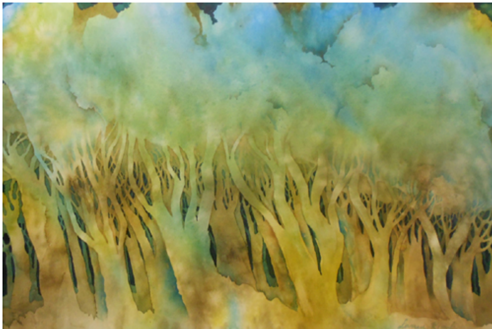
“Charmed” by Lorraine Rimmelin, 2012. Watercolor.

EAST END ARTS at RIVERHEAD TOWN HALL GALLERY - “Lorraine Rimmelin” has an Opening Reception on Tuesday, June 16 from 6 to 7:30 p.m. The exhibition remains on view through September 1. Rimmelin will show watercolors of flowers, animals and landscapes. The Riverhead Town Hall Gallery is located at 133 E. Main Street, Riverhead, NY 11901. www.eastendarts.org .