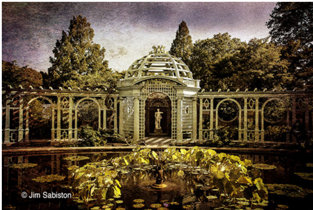
“The Lotus Pond I” by Jim Sabiston. Photograph.