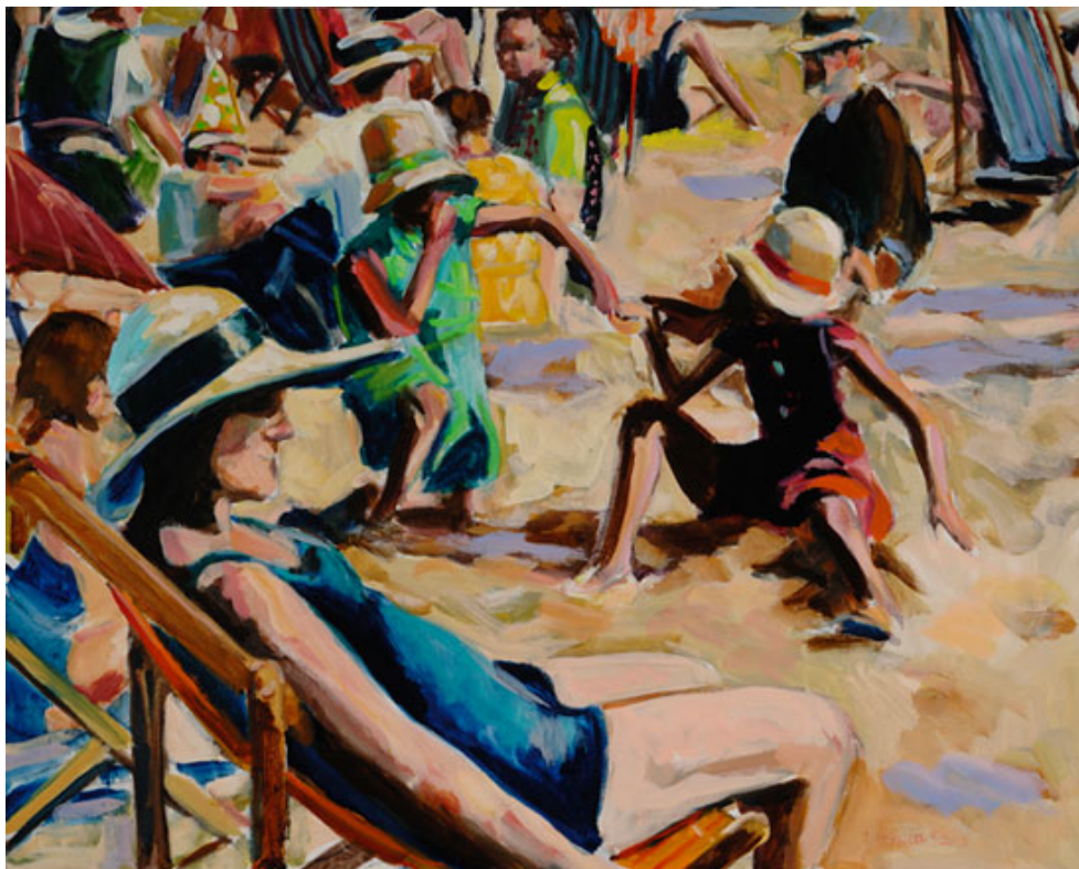
Artwork by Dinah Maxwell Smith.