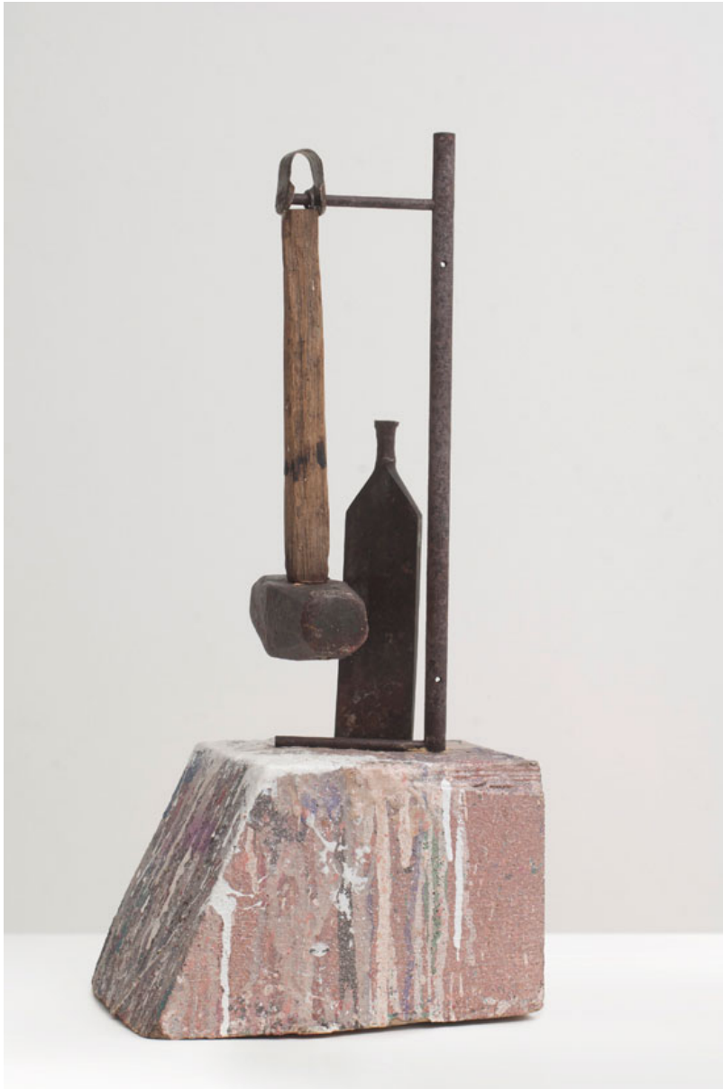
“DB-3 (trio)” by Elaine Grove, 2013. Steel, wood, acrylic paint, 20 x 6 x 10 inches.