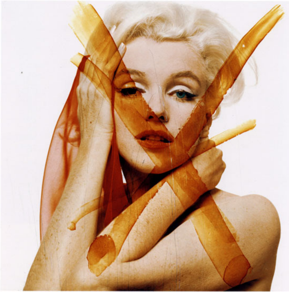
"Bue eyes (Double x)" by Bert Stern. C Print, Edition of 9, 72 x 72 inches.