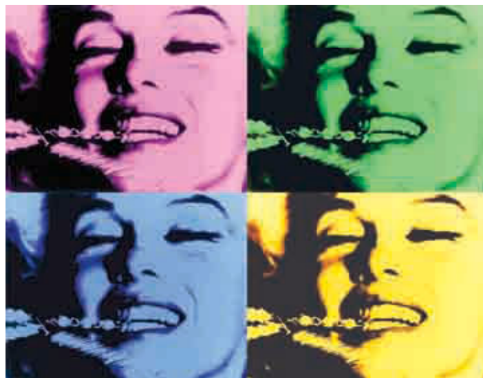
"Four Smiles" by Bert Stern. C Print, Edition of 18, 64 x 75 inches.