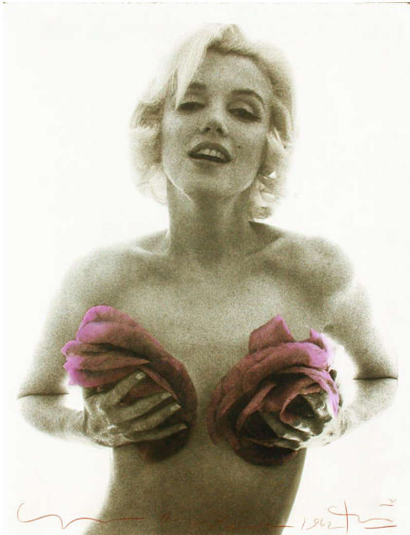
"Two Roses (Purple)" by Bert Stern. C Print, Unique, 60 x 50 inches.