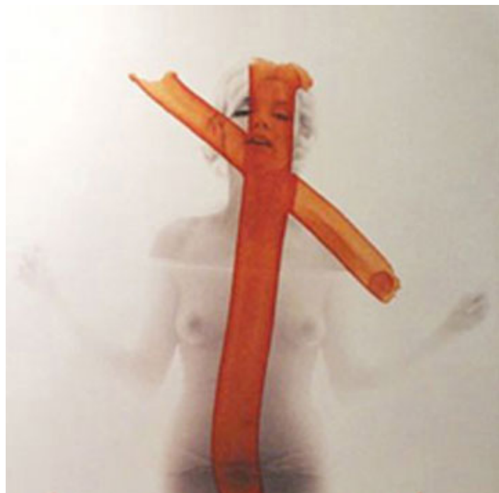
"Crucifix" by Bert Stern. C Print, Edition of 18, 50 x 50