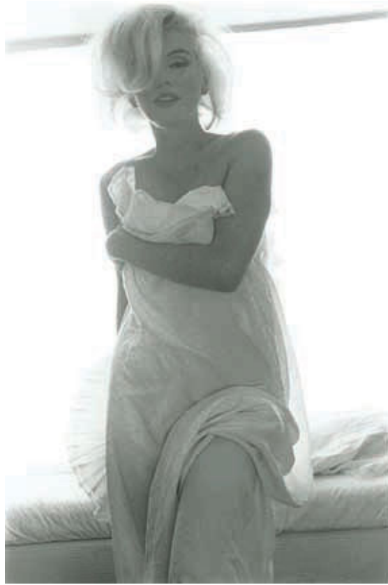
"Marilyn with bed sheet" by Bert Stern. C Print, Edition of 18, 60 x 40 inches.