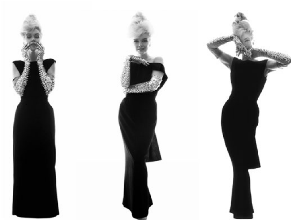
"Marilyn in Dior" by Bert Stern. C Print, Edition of 18, 60 x 72 inches.