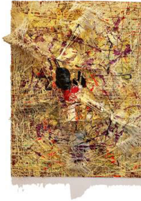
“Untitled” by Haim Mizrahi, 2014. Mixed media including acrylic/encaustic and Metal on Board, 31.5 x 24 inches.

from 6 to 9 p.m. The exhibition features dimensional Abstract Expressionist paintings created by weaving acrylics and encaustic.