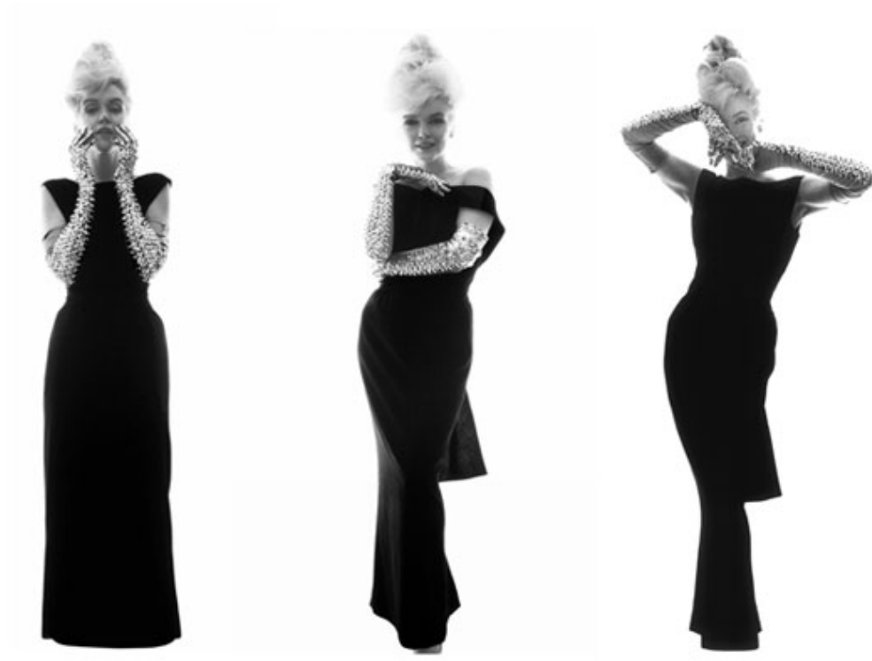
“Marilyn in Dior” by Bert Stern. C Print, Edition of 18, 60 x 72 inches.

VERED GALLERY - “Bert Stern - Marilyn in the Hamptons” has a Valentines Opening Party on Saturday from 6 to 9 p.m. The exhibition features 1962 photographs of Marilyn Monroe.