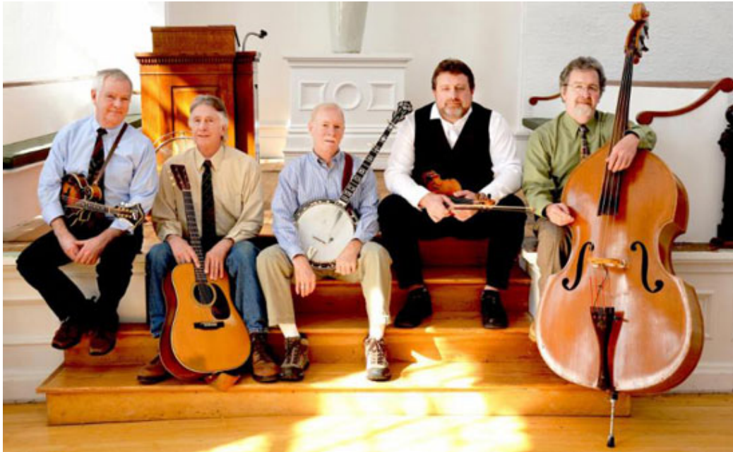
The Eastbound Freight Bluegrass Band.

SYLVESTER MANOR at SHELTER ISLAND AMERICAN LEGION HALL - “Eastbound Freight Bluegrass Band” performs at 6 p.m. Doors open at 5:30 p.m. Admission is $20. The Shelter Island American Legion Hall is located at 281 School Street, Shelter Island, NY 11964. www.sylvestermanor.org .