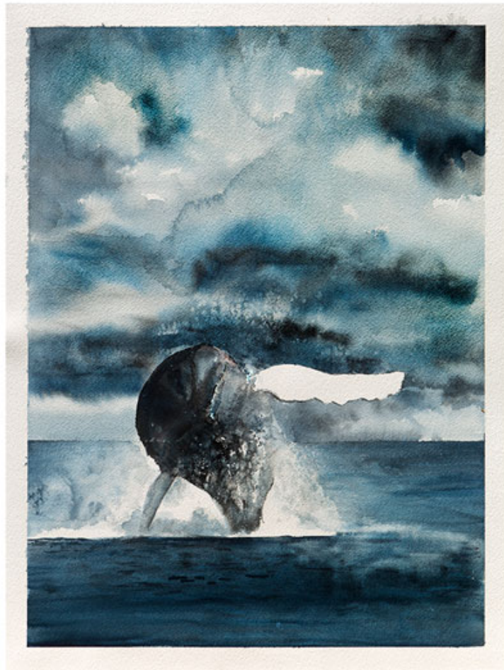
“Breach of Contract II” by Dalton Portella.

Taking a distinct approach to each of the three series on view at Outeast Gallery was a natural.