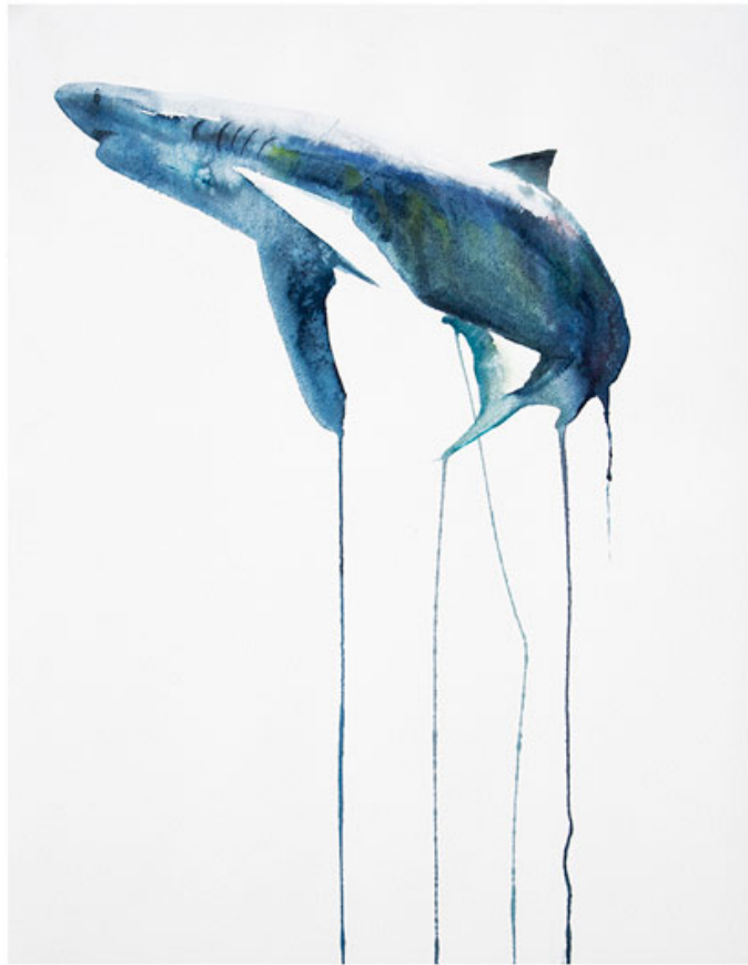
“Blue Requiem” by Dalton Portella. 24 x 18 inches.

. The “Shark” paintings take a minimalistic view so the beauty of the animal is the focus.