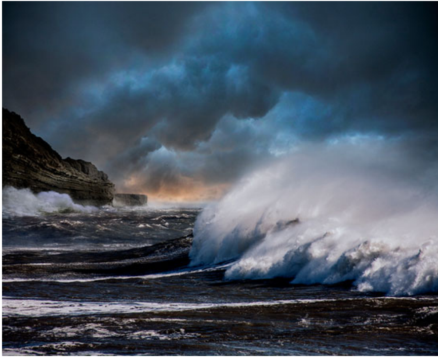
“Perfect Storm” by Dalton Portella. 32.5 x 40 inches.