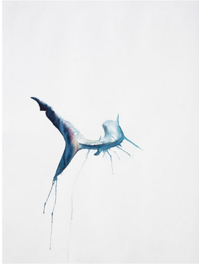
“Prionace Glauca” by Dalton Portella. 24 x 18 inches.

The Whale paintings were bycatch from the same offshore trip from Montauk.