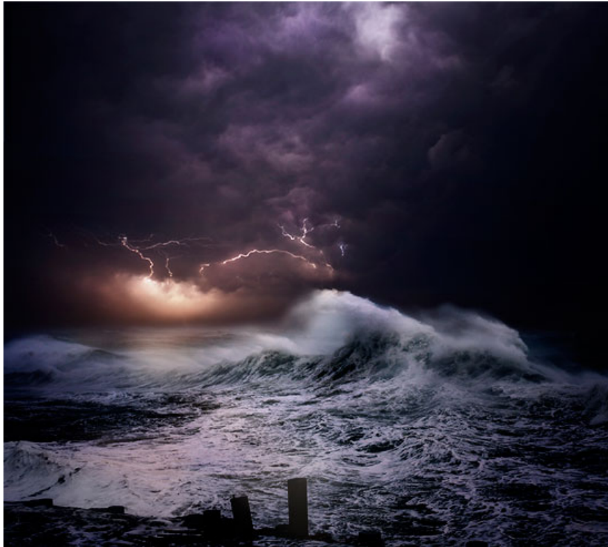
"Fury VII" by Dalton Portella. 32.5 x 40 inches.