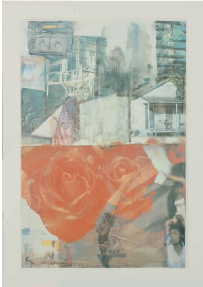
“Domicile” by Robert Rauschenberg, 1996. Lithograph, 41 x 27 1/8 inches. Gift of the artist to the Foundation for Art and Preservation in Embassies.