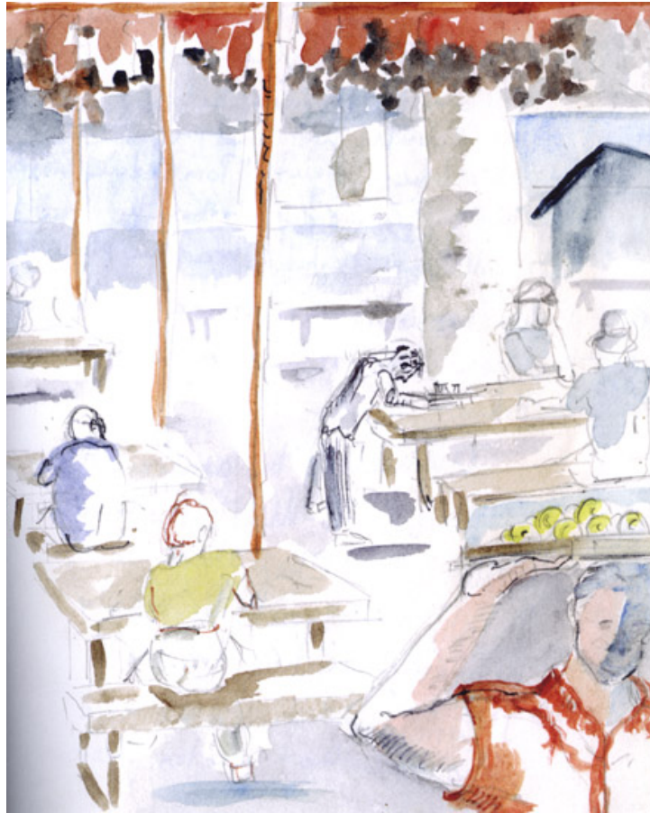
“Market” by Billy Rayner.

Nina Yankowitz’s Criss~Crossing the Divine is an interactive installation that uses technology to allow people to explore the relative perspectives of sacred texts. Scriptures from the Old Testament, New Testament, The Quran, Buddhist and Hindu texts are color-coded to easily identify “searched perspectives” to later reveal the root religions of their interests.