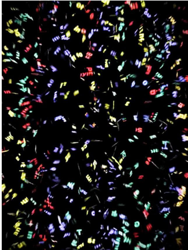
“Exploding Texts - Criss~Crossing the Divine” by Nina Yankowitz.

“ Arlene Slavin Intersections ” presents an outdoor exhibition of new sculpture plus recent paintings. The geometric works in Slavin’s Intersection series are constructed from translucent colored materials and designed (and sited) to cast shadow images that change with the movement of the sun.