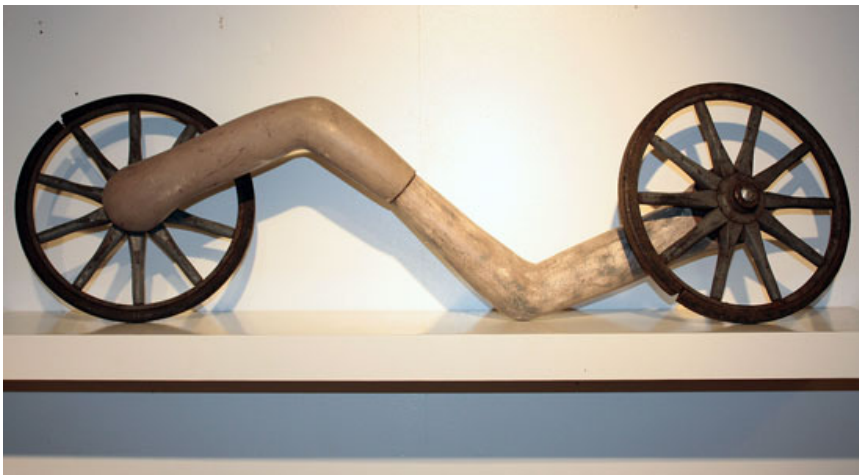
"Relax" by Pierre Cote.