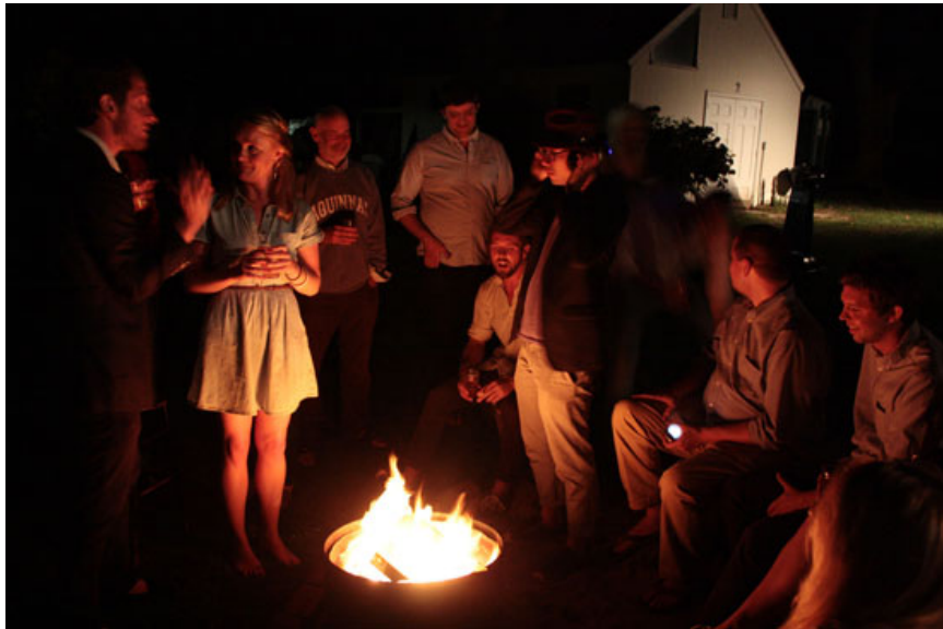
Gathering around the fire.