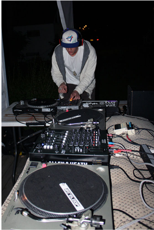
The "Silent" DJ, broadcasting to the dancers' head sets.