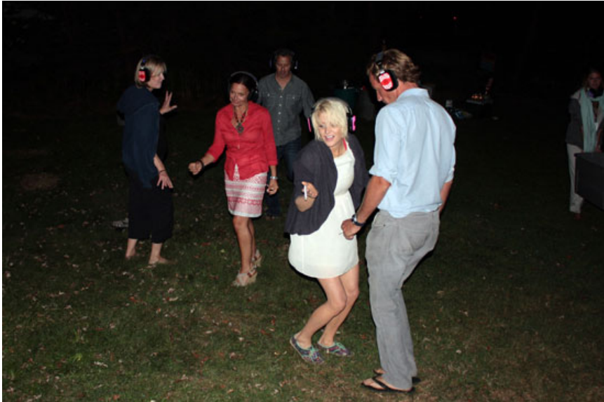
Dancing at the Silent Disco.