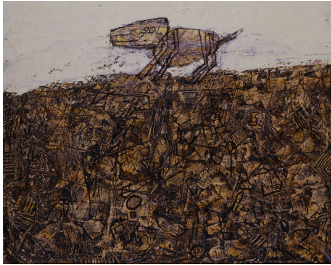
“Paysage au Chien” by Jean Dubuffet. Courtesy Parrish Art Museum.

“MICHELLE STUART: DRAWN FROM NATURE” continues through Oct. 27. The solo show includes 50 works ranging from 1968 to the present that encompass a range of mediums and highlight her early contributions to process-based sculpture and Land Art along with her use of nontraditional natural materials and her passion for photography.