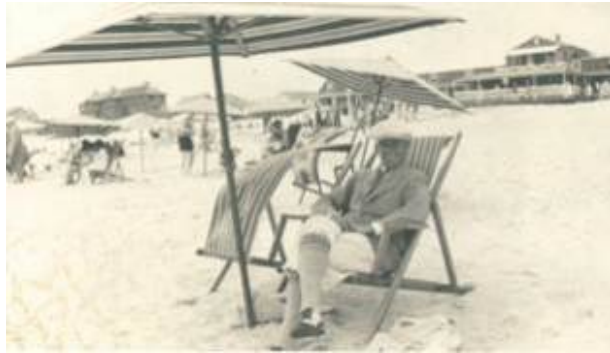
Photographs: Main Beach, East Hampton, 1929.

The Clinton Academy Museum is located at 151 Main Street, East Hampton, NY 11937. www.easthamptonhistory.org .