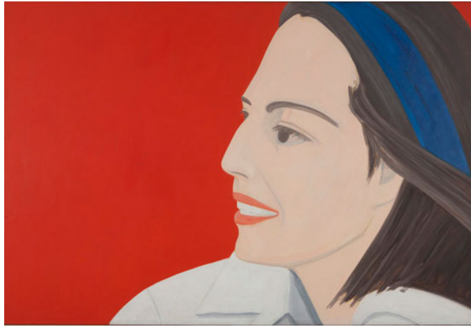
“The Red Smile” by Alex Katz, 1963. Oil on canvas, 78 7/8 x 115 inches. Whitney Museum of American Art, New York; purchase, with funds from the Painting and Sculpture Committee 83.3. Art © Alex Katz / Licensed by VAGA, New York, N.Y.