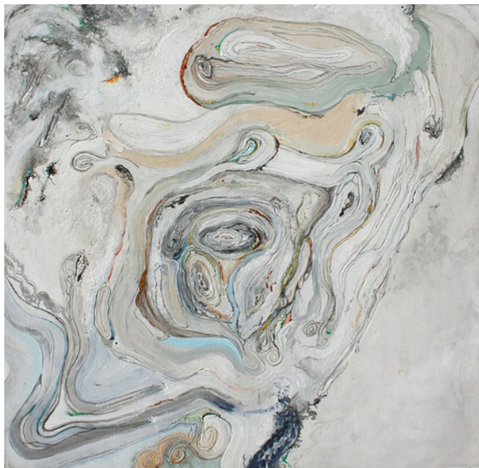
“Oak and Sea” by Jon Mulhern, 2012. Acrylic, ink, watercolor, and mixed media.

GLENN HOROWITZ BOOKSELLER - “Tara Geer: Carrying Silence” has an Opening Reception on Saturday from 6 to 8 p.m. The exhibition remains on view through Sept. 3. The gallery is located at 87 Newtown Lane, East Hampton, NY 11937. www.glennhorowitz.com .