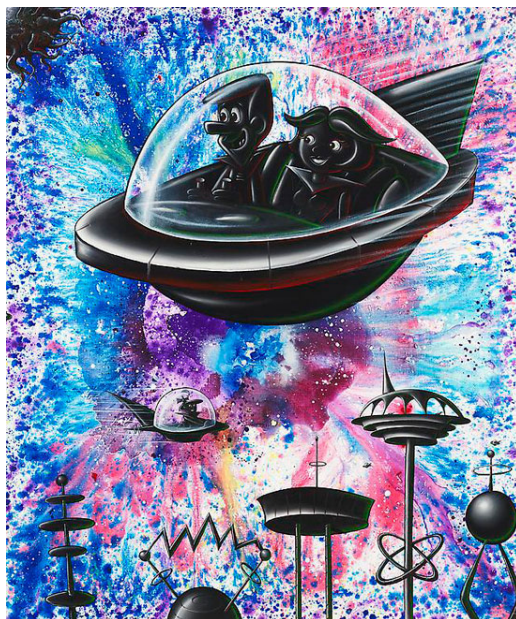
"Obsidian Barbera Futura" by Kenny

ERIC FIRESTONE GALLERY - "Amerikulture" by Kenny Scharf and Tseng Kwong Chi has an Opening Reception tonight (Friday) from 6 to 9 p.m. The exhibition was curated by Scharf and focuses on the two artist's interpretations of Americana. Scharf will exhibit recent paintings and Tseng will show photographs. The exhibition remains on view through Aug 12. The gallery is located at 4 Newtown Lane, East Hampton, NY 11937. www.ericfirestonegallery.com