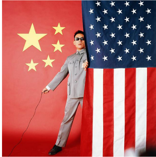
“East Meets West Manifesto” by Tseng Kwong Chi, 1983. Color C-Print Mounted on Dibond, 50 x 50 inches.

Scharf, 2013. Oil, acrylic, and glitter on canvas, 72 x 60 1/8 inches.