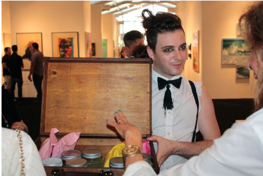
Unusual offerings during the Opening Preview of artMRKT Hamptons 2013.