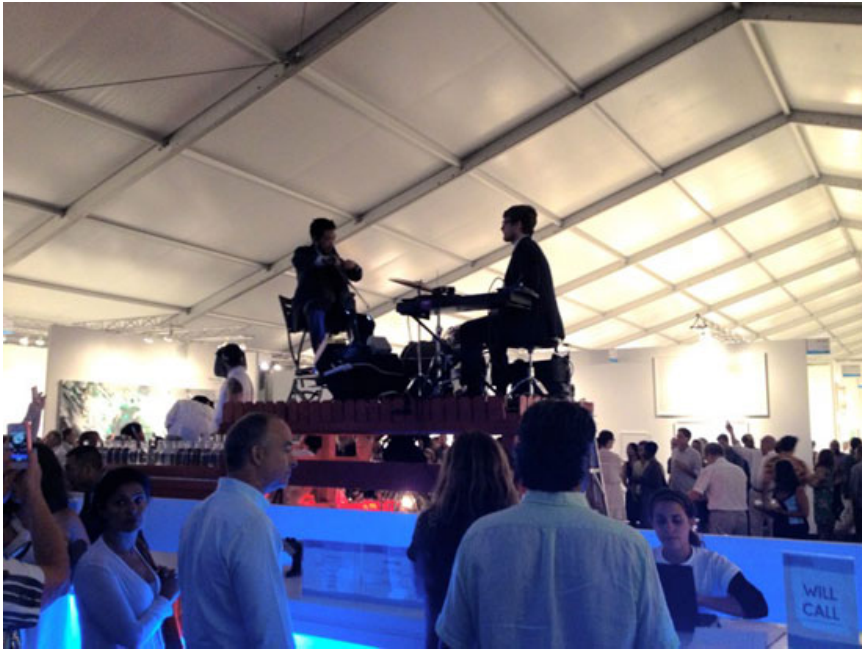
artMRKT neon entry with Live Footage band.