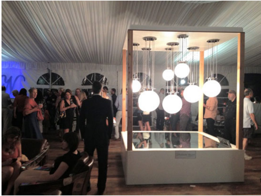
LUXE VIP Lounge.