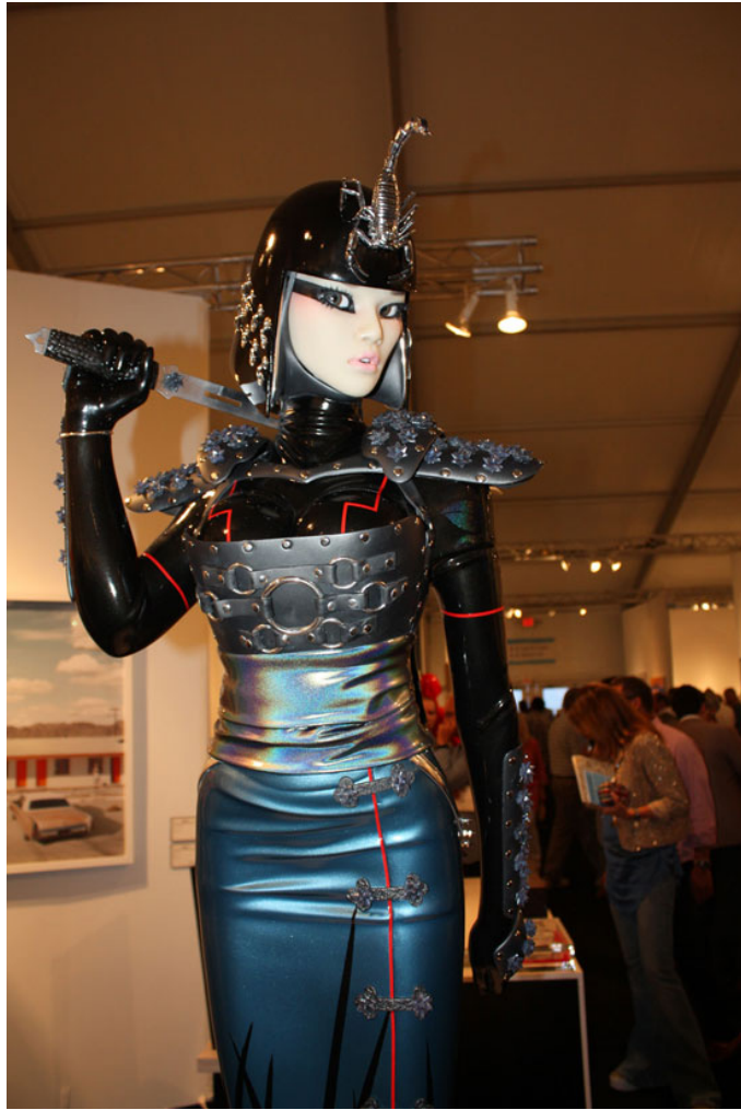
Anime sprung to alive during the opening of artMRKT Hamptons 2013.