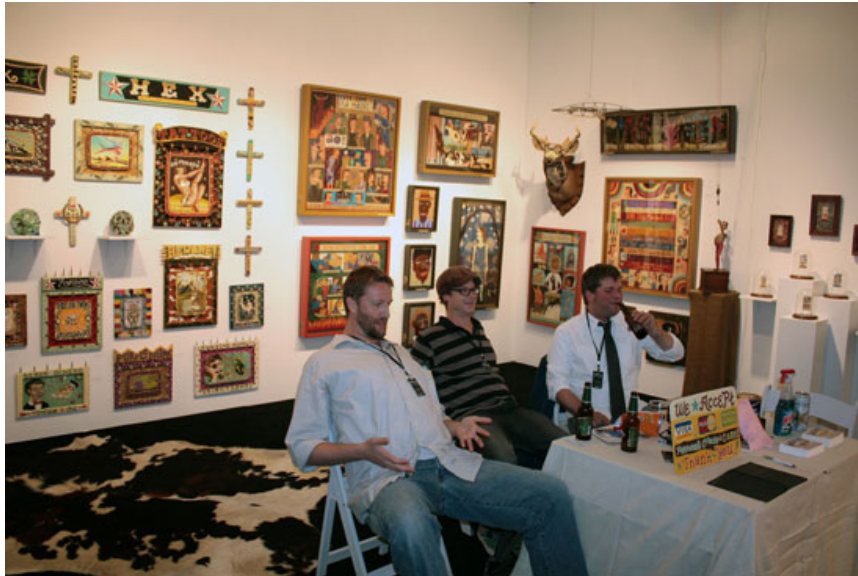
The Red Truck Gallery of New Orleans.