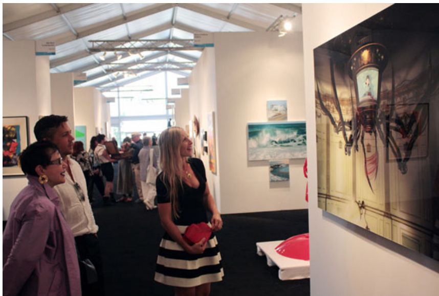
Viewing art during the Opening Preview of artMRKT Hamptons 2013.