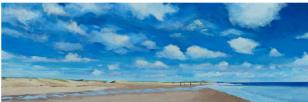
“It's Still Summer” by Patricia Feiler. Acrylic on canvas, 12 x 36 inches.

On the day after Labor Day, Cupsogue Beach is nearly empty. A ribbon of tidal pools sparkles on the shore. It's still summer.