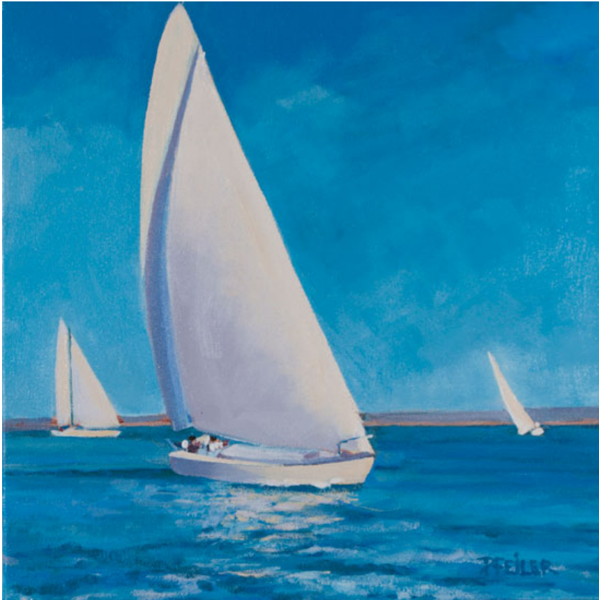
"Afternoon Sail" by Patricia Feiler. Acrylic on canvas, 16 x 16 inches.

On the 4th of July, vintage sailboats from the early 1900's race to the finish at the Westhampton Yacht Squadron.