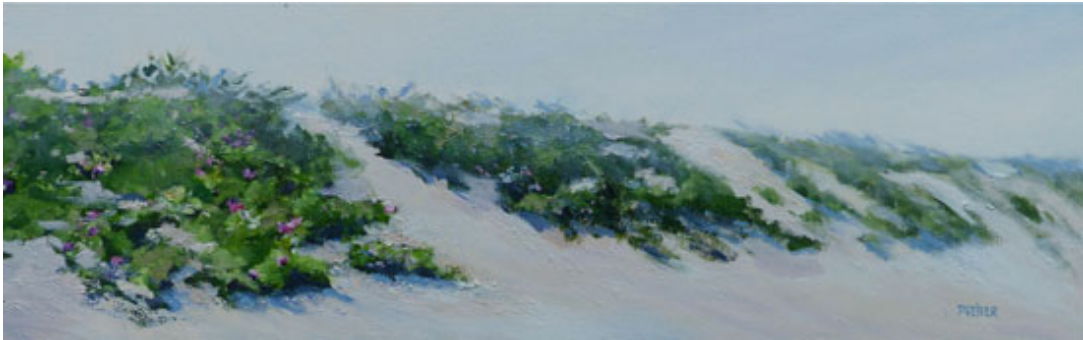
“Morning Mist on the Dune”, Acrylic on Gallery Wrapped Canvas, 12 x 36 inches.

An early morning mist steals across lush green Rosa Rugosa on the dunes of Tiana Beach.