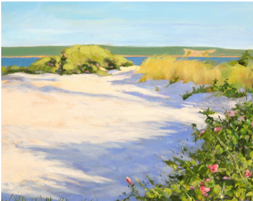
“Bayside Afternoon” by Patricia Feiler. Acrylic on canvas, 22 x 28 inches.

Early evening shadows fall across the sandy beach on the Peconic Bay.