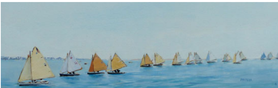
"4 of July Vintage Regatta" by Patricia Feiler. Acrylic on canvas, 12 x 36 inches.

On the 4th of July, vintage sailboats from the early 1900's race to the finish at the Westhampton Yacht Squadron.