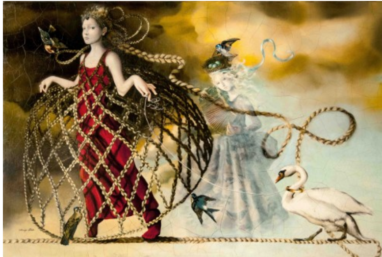
“Defined by Hair II” by Margo Selski. Oil and beeswax on canvas, 40 x 60 inches.

ROMANY KRAMORIS GALLERY - “Power and Protection: Bully Proof Vests” by Linda Stein has an Opening Reception on Saturday from 5 to 7 p.m. Stein’s vests feature heroic and feminist icons in order to empower the wearer and address issues of strength and justice in contemporary culture.