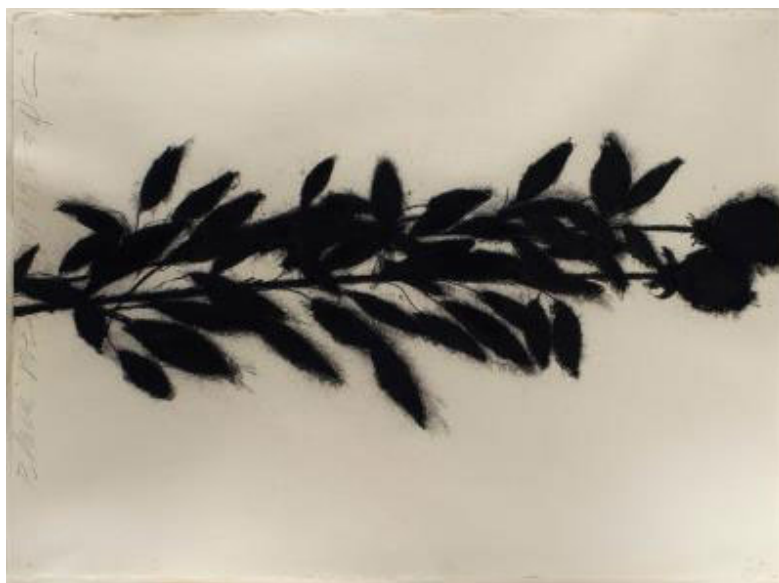
"Black Roses, Aug 1989" by Donald Sultan. Charcoal on paper, 22 x 30 inches.