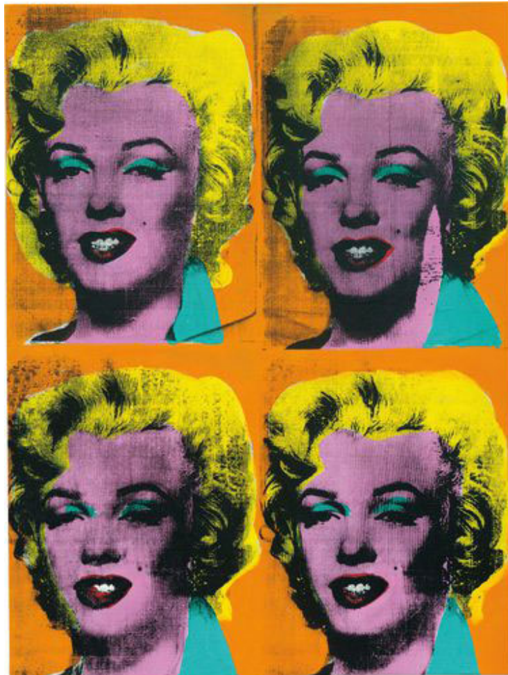
“Four Marilyns” by Andy Warhol, 1962.