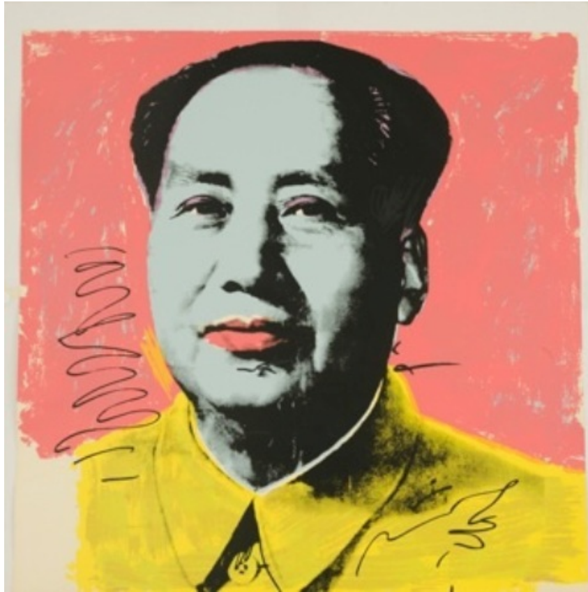
“Mao No. 4” by Andy Warhol, 1972, 36 in x 36 inches.