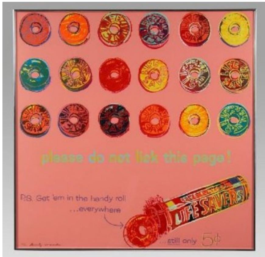
“Lifesavers, 1986” by Andy Warhol.