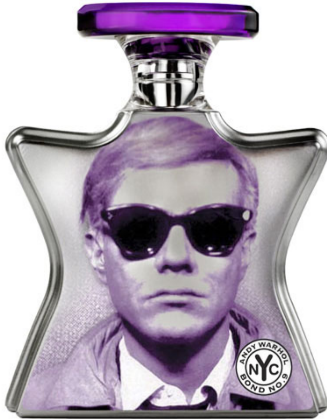
Bond No. 9 Fragrance, Andy Warhol.

At Art Southampton, Warhol will be a centerpiece at the art fair that's bound to be celebrity-studded. A special art exhibition featuring Warhol is being organized by Gallery Valentine of East Hampton. It also includes a VIP cocktail party and a discussion with several Andy Warhol experts.