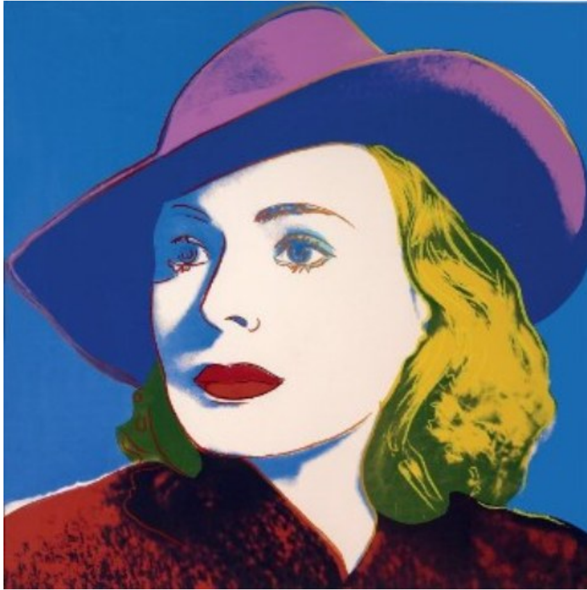
“Ingrid Berman, 1983” by Andy Warhol

“Star (Greta Garbo)” by Andy Warhol, 1981.