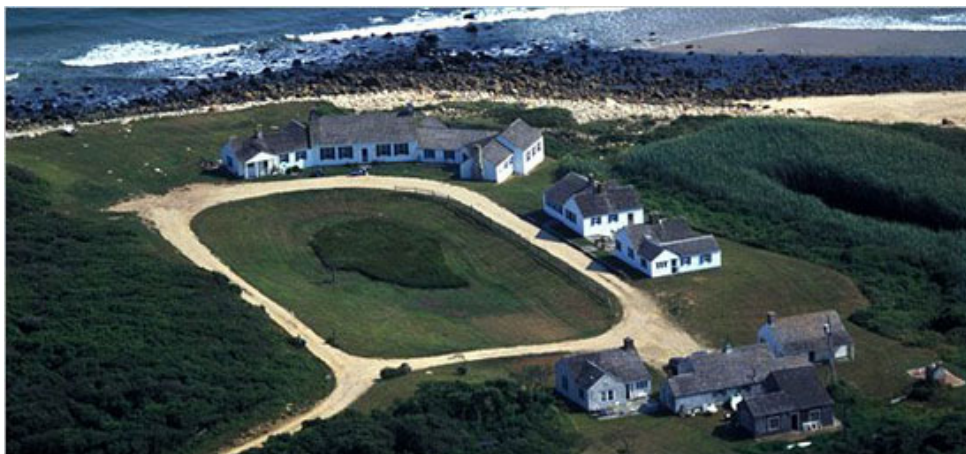
Eothen in Montauk.

Paul Morrissey owned Eothen for decades after Warhol’s death in 1987, finally selling it to J.Crew CEO Mickey Drexler in 2007 for nearly $30 million.