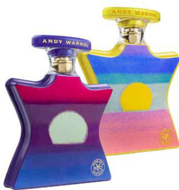
Bond No. 9 Fragrance, “Montauk.”

Warhol liked the sunset because as he said “The idea of waiting for something makes it more exciting.”