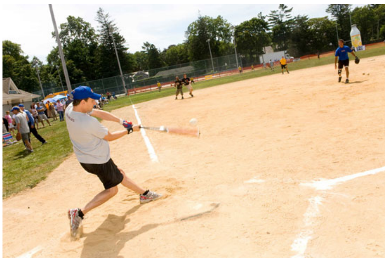
The Good Wife’s Josh Charles.

In addition to celebrity sightings, “Artists & Writers: They Played In the Game” will present art and writing by those who have played in the game. The artwork in the exhibition was either loaned by artists or collectors or is part of Guild Hall Museum’s permanent collection. The show is curated