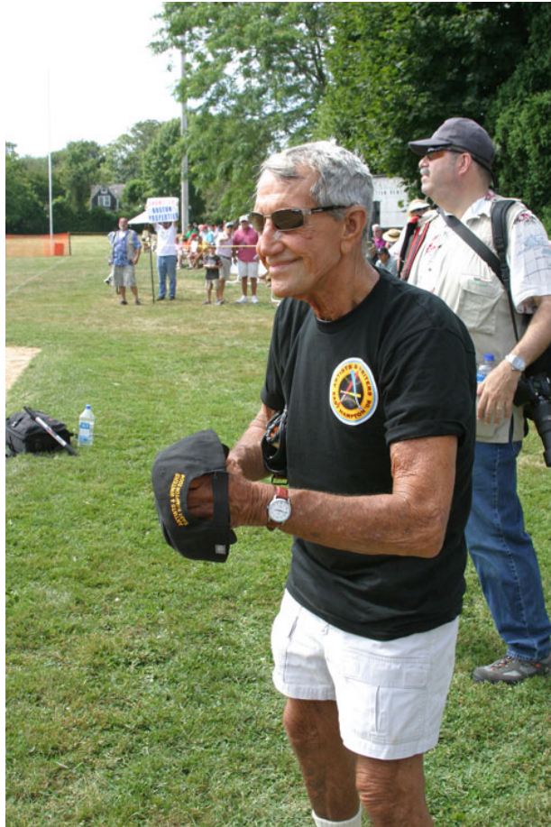
Roy Scheider.

The Artists and Writers Softball game takes place annually in August in Herrick Park. The event benefits local charities that include East End Hospice, East Hampton Day Care Learning Center, The Phoenix House Adolescent Center in Wainscott and The Retreat based in the Hamptons.