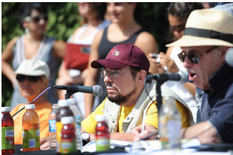
James Lipton and Bert Sugar.

To pay homage to the long line of celebrities, artists, writers and creative talent, “They Played In The Game” will include two flat screens will highlight decades of photos and footage from many of the games.