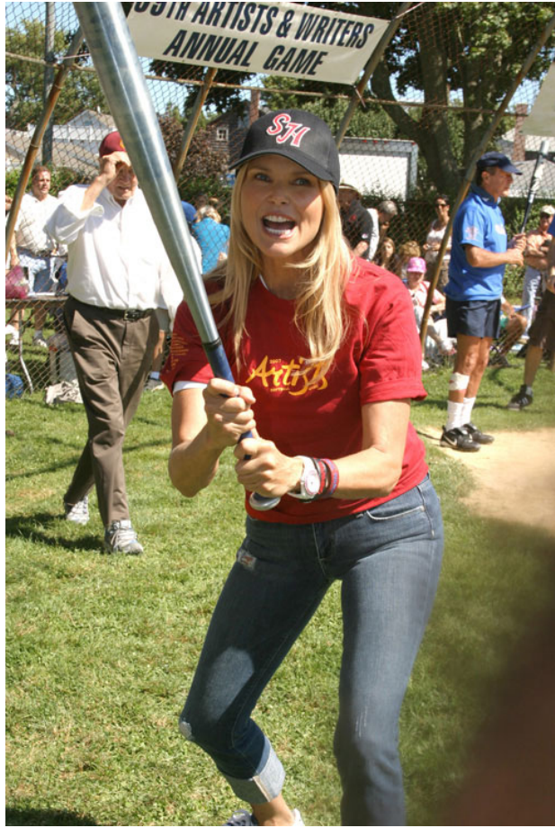
Christie Brinkley.