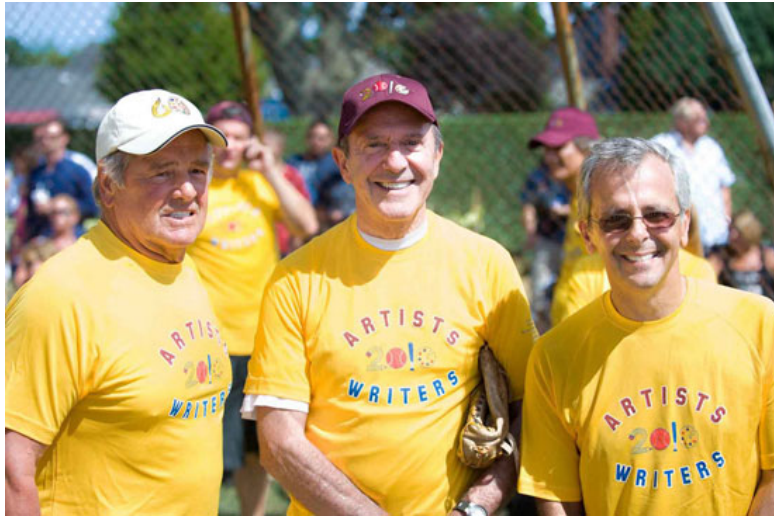
Hockey legend Rod Gilbert, Mort Zuckerman, and Mike Lupica.