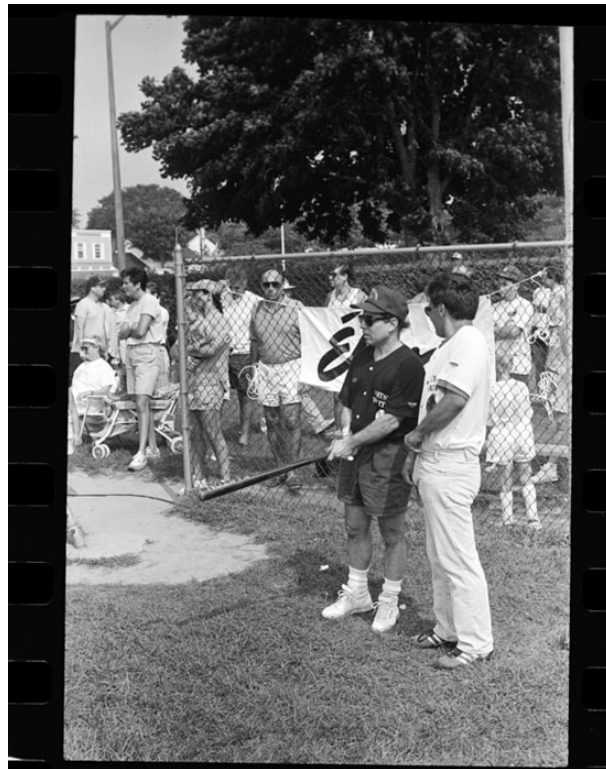
Paul Simon.

Even the umpires have a celebrity line-up. They have included President Bill Clinton, Supreme Court Justice Stephen Breyer, former New York City Mayor Rudy Giuliani, Anne Jackson, Eli Wallach and Gwen Verdon.