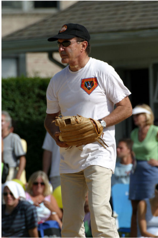
Mort Zuckerman.