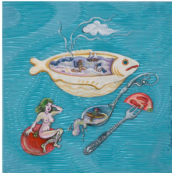
"Soup de Jour" by Caroline Waloski. Acrylic on Optic Plastic Panel, 12 x 12 inches.

For information and a preview of some of the artworks, click "Flights of Fancy Opens June 8 at the Siren's Song Gallery."