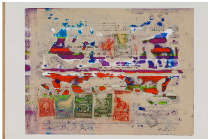
Artwork by Gavin Zeigler. Courtesy Peter Marcelle Contemporary.

PETER MARCELLE GALLERY - "Gavin Zeigler: A Thirty Year Retrospective of Painting and Sculpture, 1983 - 2013" opens Saturday. The Opening Reception will be held next Saturday (June 15) from 6 to 8 p.m. Zeigler creates mixed media paintings using everyday objects with a focus on surface, pattern, and color. The exhibition remains on view through June 23. The gallery is located at 2411 Main Street, Bridgehampton, NY 11932. www.petermarcellecontemporary.com