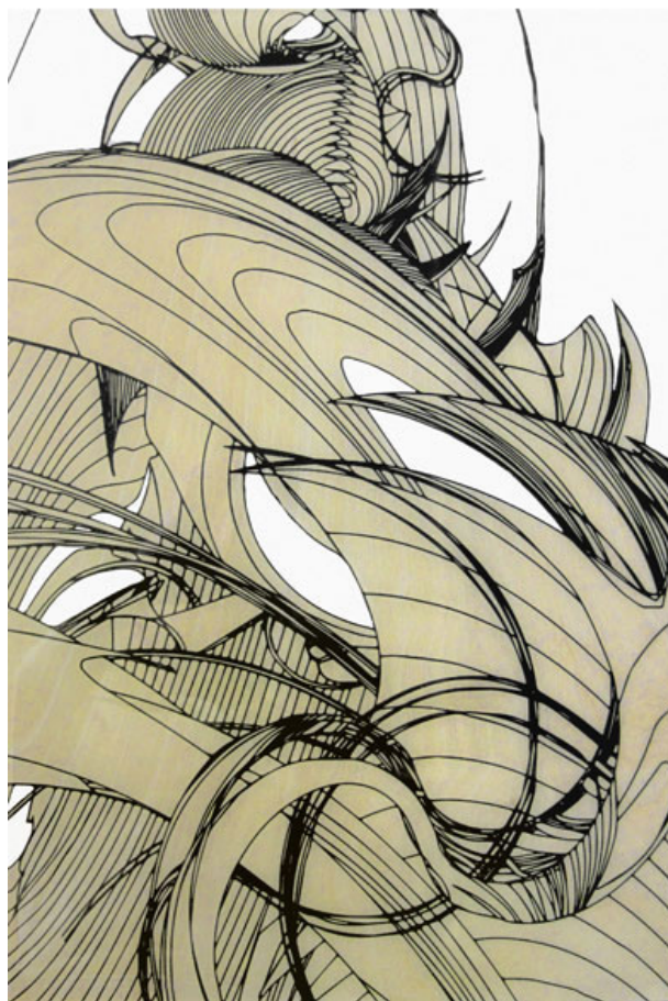
"Tozai" by Colin Goldberg, 2013. Pigment transfer and acrylic with liquid polymer on