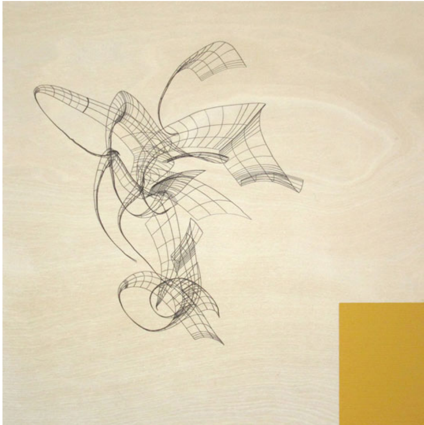
"Wireframe with Yellow Square" by Colin Goldberg, 2013. Pigment transfer and acrylic with liquid polymer on birch panel, 12×12 inches.

BASIC FACTS: "Improbable Forms" - A solo show by Colin Goldberg opens on May 11 at Art Site gallery. The exhibition remains on view through June 2. An opening reception will be held on Saturday, May 11, from 5 to 7 p.m. To see artworks in the show, visit www.improbableforms.com .