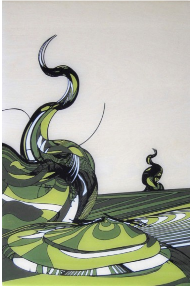
“Shokushu” by Colin Goldberg, 2013. Pigment transfer and gouache with liquid polymer on birch panel, 18 x 12 inches.