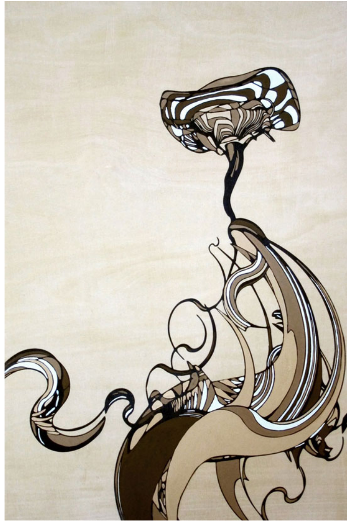
"Hana" by Colin Goldberg, 2013. Pigment transfer and gouache with liquid polymer on birch panel.