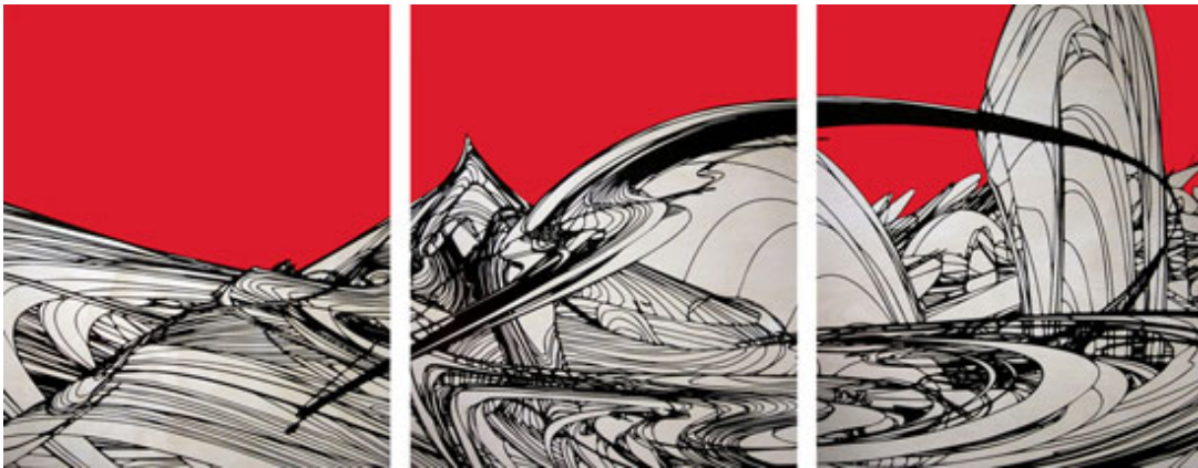
"Inazuma" by Colin Goldberg, 2013. Pigment transfer and acrylic with liquid polymer on birch panels, 24 x 62 inches.

Goldberg is currently represented by Yes Gallery in Brooklyn and the South Street Gallery in Greenport. He was one of four artists in Suffolk County awarded the 2013 Long Island Creative Individuals Grant, which funded the production of the work for this exhibition.