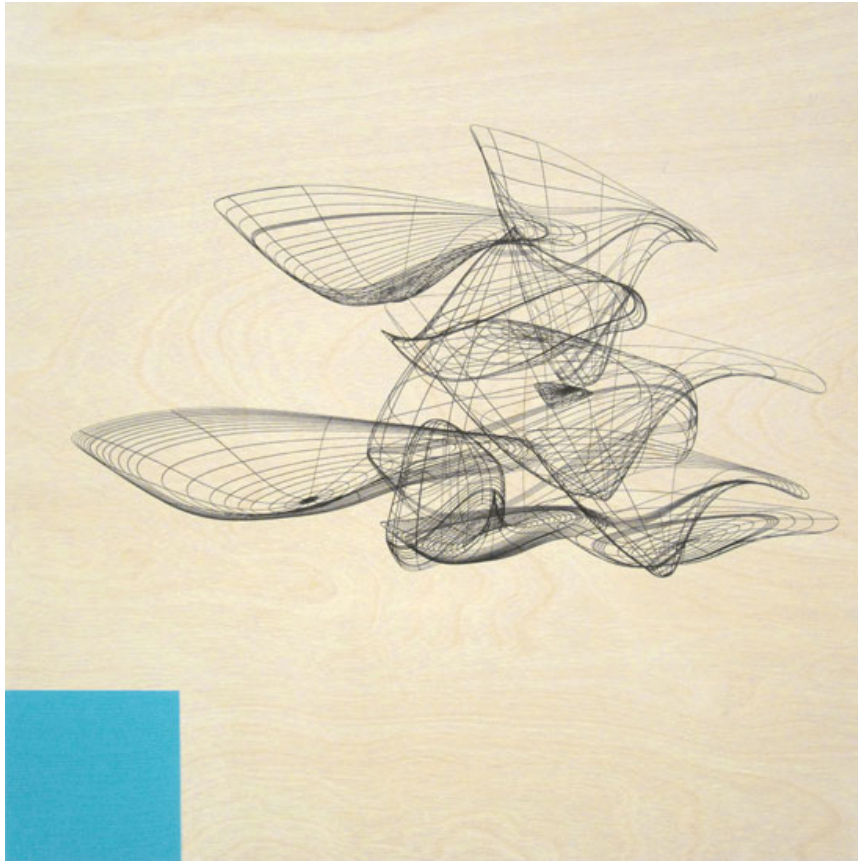
"Wireframe with Blue Square" by Colin Goldberg, 2013. Pigment transfer and acrylic with liquid polymer on birch panel, 12×12 inches.