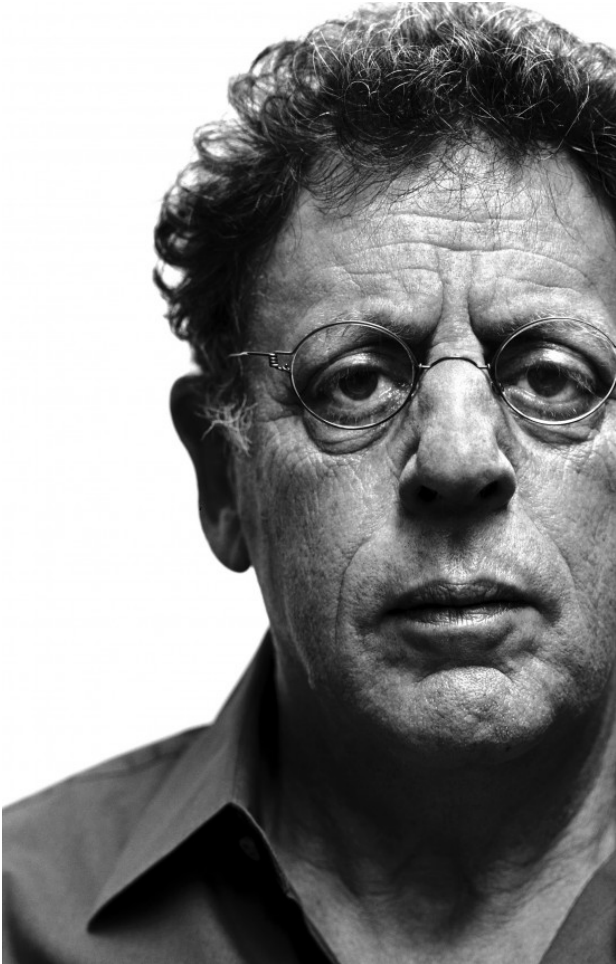
American composer and musician Philip Glass.

Philip Glass is a renowned composer whose work has been performed worldwide. Over the last 25 years, Glass has composed operas, symphonies, piano concertos, concertos for violin, piano, timpani, and saxophone quartet and orchestra; soundtracks for films, and works for experimental theater, solo piano and organ.