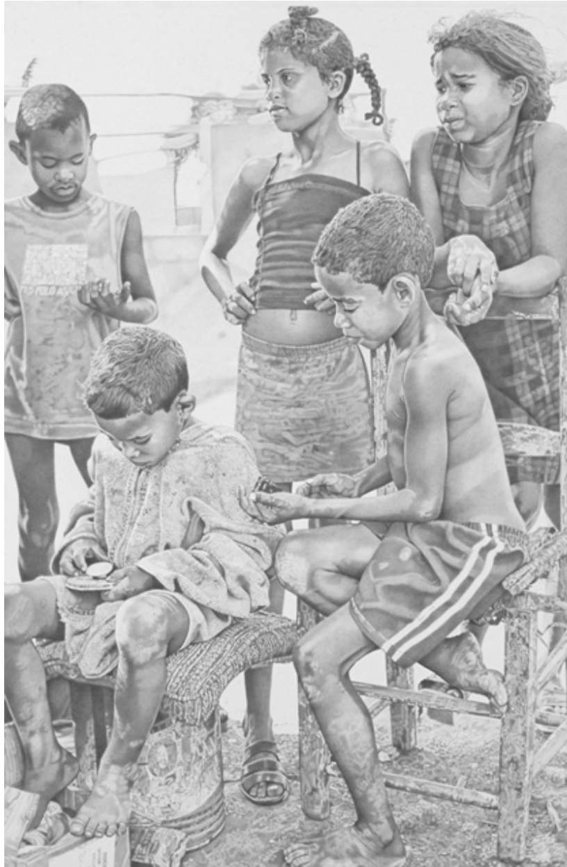
“Imagining” by Jeanette Martone. Graphite and ink on paper, 41 x 26.5 inches.

“By limiting color, and emphasizing texture in my drawings, attention is focused on the essential elements of the subject. Complex images are formed that are reminiscent of the protoplasmic origins of life we share. The simplicity and purity of pencil and paper lend an immediacy and intimacy to the work. By creating an interconnectedness between the subject and viewer, it opens up unfamiliar emotions, introspective questioning, and the search for answers.”