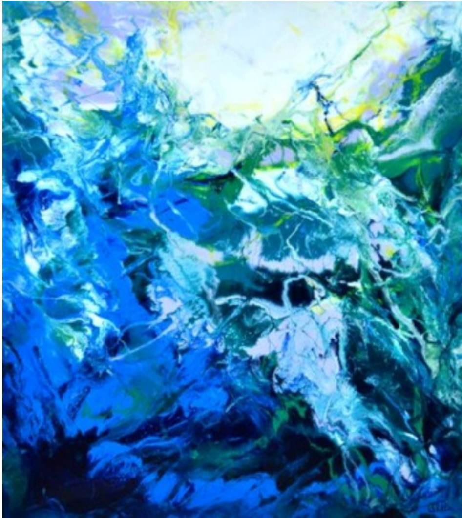
"Tranquil Ascension" by Barbara Bilotta. Acrylic with Resin on Canvas, 52 x 26 inches.