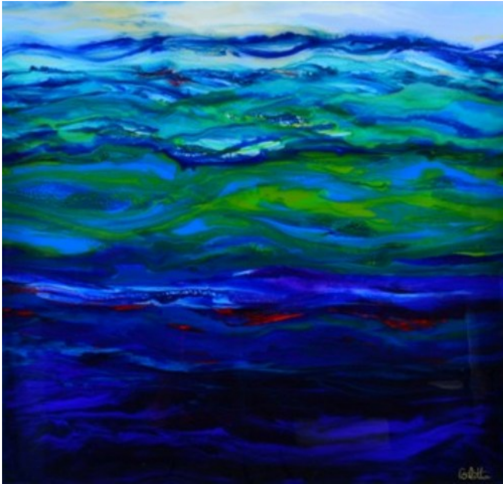
"Tides of Eternity" by Barbara Bilotta. Acrylic with Resin on Canvas, 39 x 41 inches.

The mixing of acrylic and resin also accentuates the intensive layering involved in each piece. Bilotta's work thereby gains an architectonic quality.