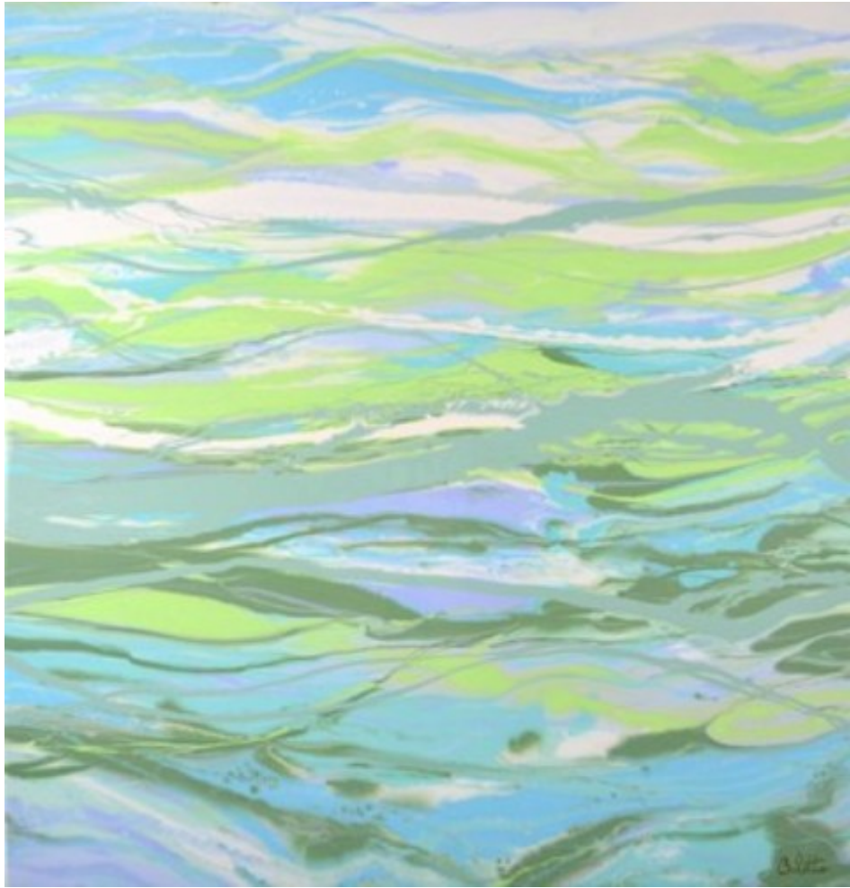
"Oceanic Hues" by Barbara Bilotta. Acrylic with Resin on Canvas, 41 x 39 inches.

The striking abstract patterns in her works are more than just arrangements of colors and shapes. Her love of nature animates those patterns, forging a connection between pure abstraction and organic forms.