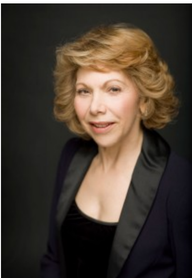
Victoria Bond, Composer.

Bond launched the festival of original music in 1998 to showcase new music and provide the opportunity for contemporary audiences to engage with living and working composers. The composer is present when their piece is performed and engages with a talk back with Bond.