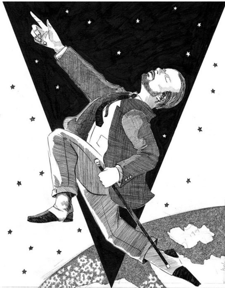
“Elijah” by Timothy Decker.

Artist Timothy Decker created drawings illustrating the various sections. These will be projected during the performance. Following is just a few of them: