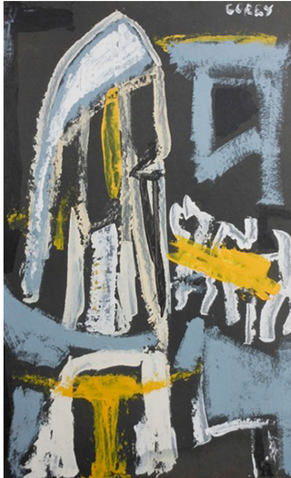
Artwork by Lance Corey.