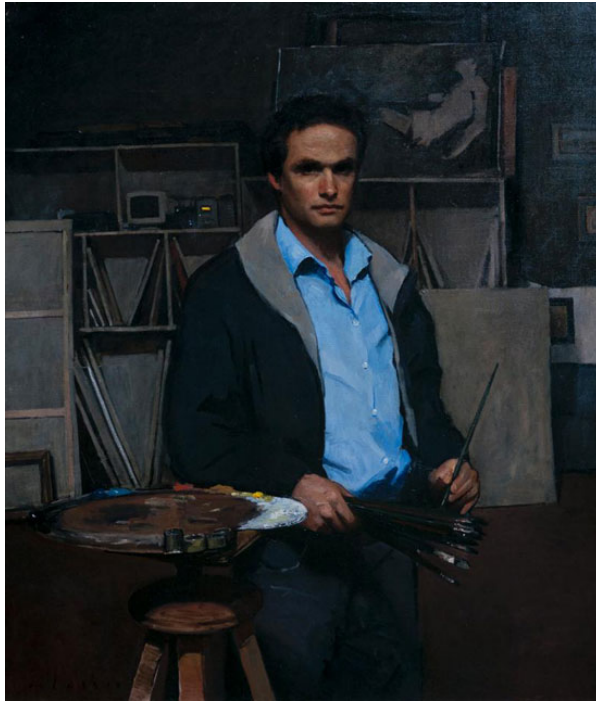
“Self Portrait” by Marc Dalessio, 2007. Oil, 60.5 x 41.5 inches.