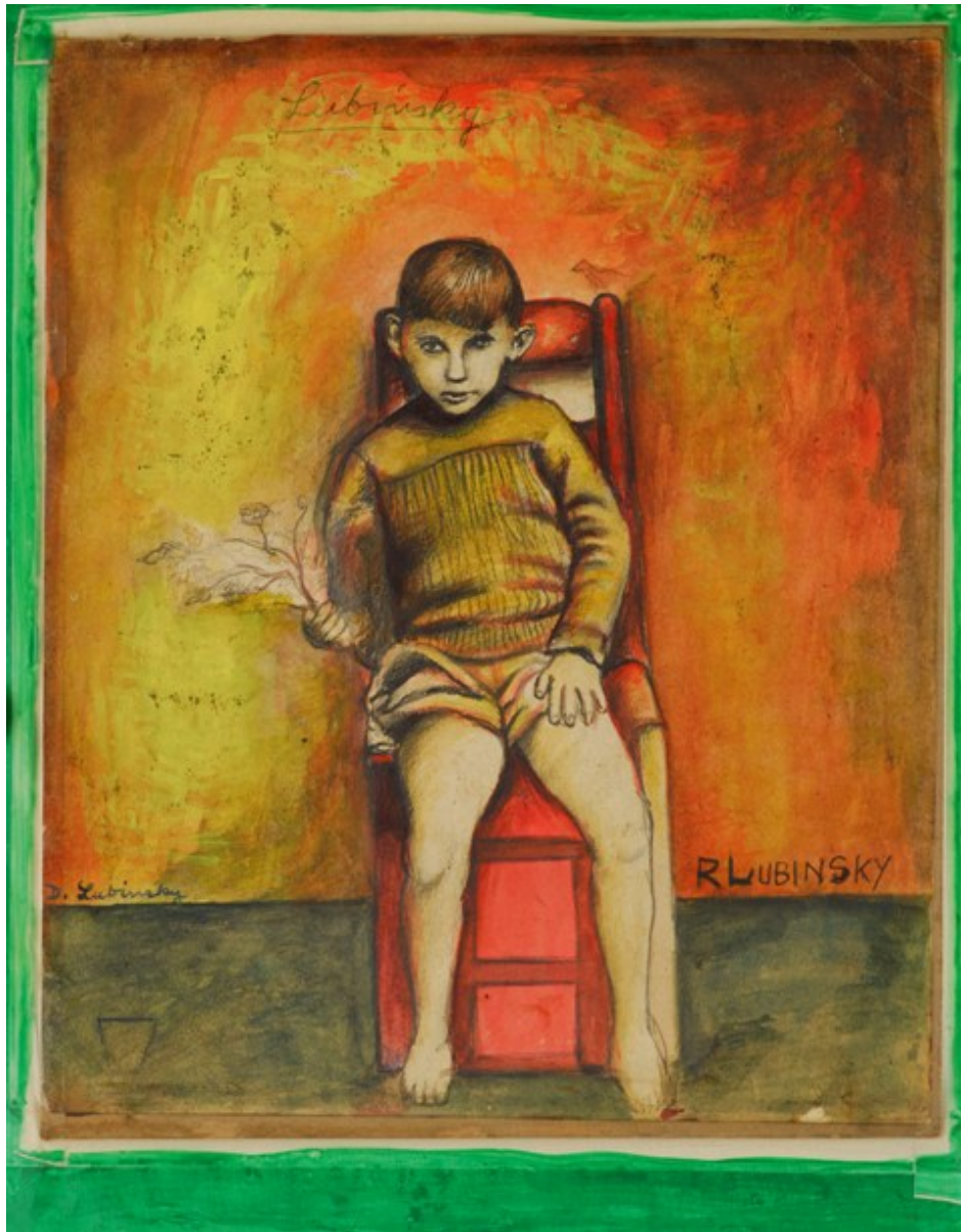
"Boy with Flowers" by Dick Lubinsky, 1963. Mixed media on paper, 13 3/4 by 10 5/8 inches. Exhibited with Fountain Gallery.

Accompanying the Outsider Art Fair is a full slate of programming and special events. These include lectures taking place at the fair and a symposium held at the American Folk Art Museum at Lincoln Center. Each presentation features several speakers.