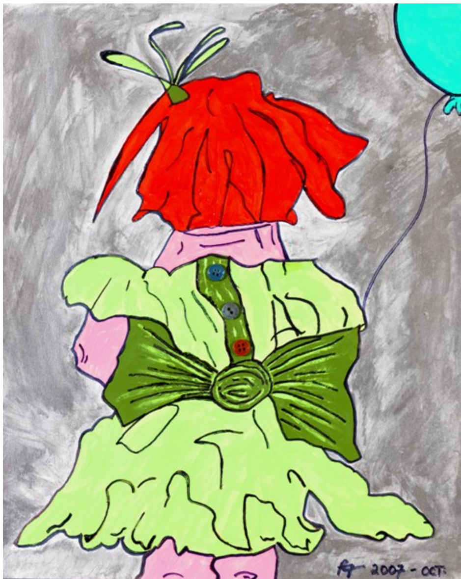
“Birthday Jenny” by Robin Taylor, 2007. Acrylic on paper, 17 x 14 inches. Exhibited with Fountain Gallery.