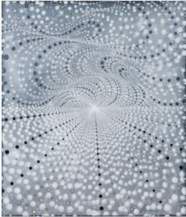
"Whiteout" by Barbara Takenaga, 2011. Acrylic on linen, 42 x 36 inches. Exhibited with DC Moore Gallery (New York, NY).