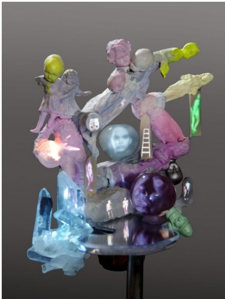
“Hierarchical Pastel” by Tony Oursler, 2012. Steel Stand, Projection and Mixed Media, 64 x 8 x 20 inches. Exhibited Gallery Paule Anglim (San Francisco, CA).

Here are a few artworks exhibited at the Miami Project 2012: