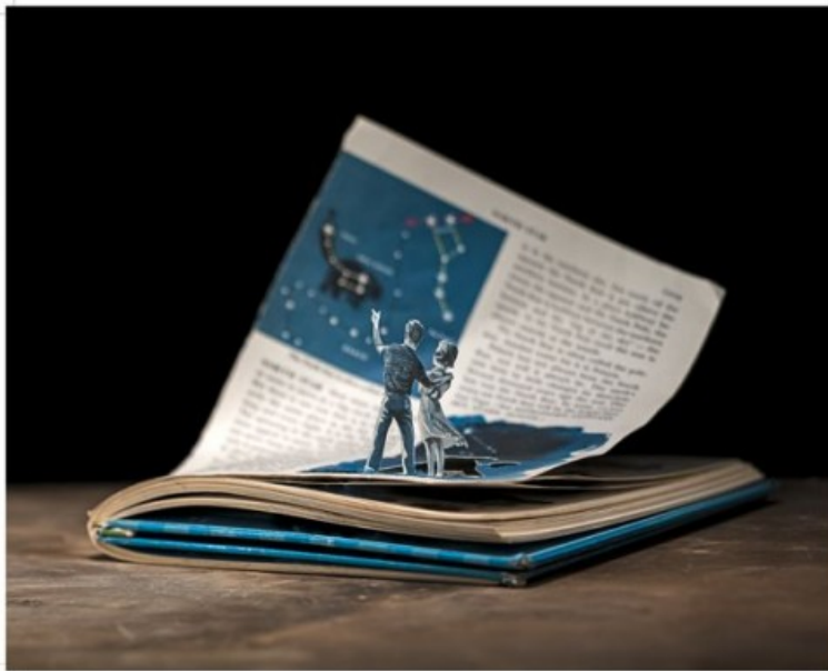
"Bearings" by Thomas Allen, 2012. Chromogenic print, 12 x 15 inches. Exhibited FOLEY (Chelsea, NY).