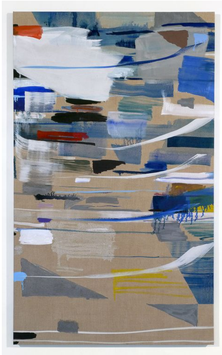
"Monte Vista to Central" by Pamela Jorden, 2012. Oil on linen, 60 x 36 inches. Exhibited with Romer Young Gallery (San Francisco, CA).