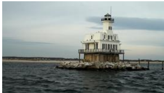
Film still from Long May You Shine by Mark Costello Higgins.

The festival opens today with three screenings set at 4:30 p.m. ( The City Dark ), 6:45 p.m. ( Long May You Shine ) and 8:15 p.m. ( Shelter Island: Art + Friendship + Discovery ).