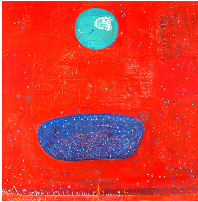
'In' by Sharon Horvath, 2012. Pigment, ink, and polymer on paper on canvas, 46 x 45 inches.