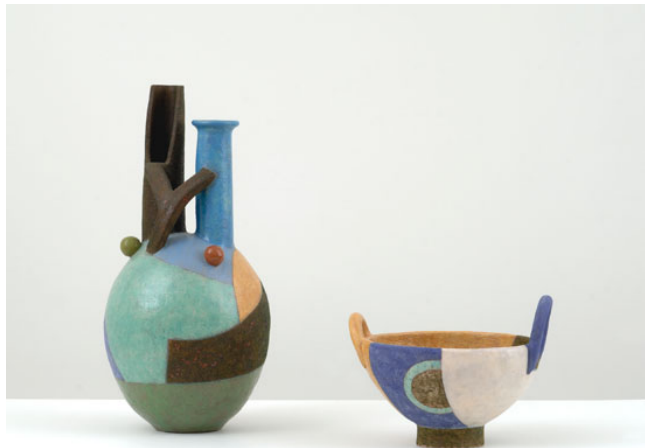
"The Cypriot Series (#12 and #13)" by Diane Mayo, 2012. Ceramic, 19 3/4 x 8 1/2 x 8 1/2 inches and 8 x 11 x 9 1/8 inches.