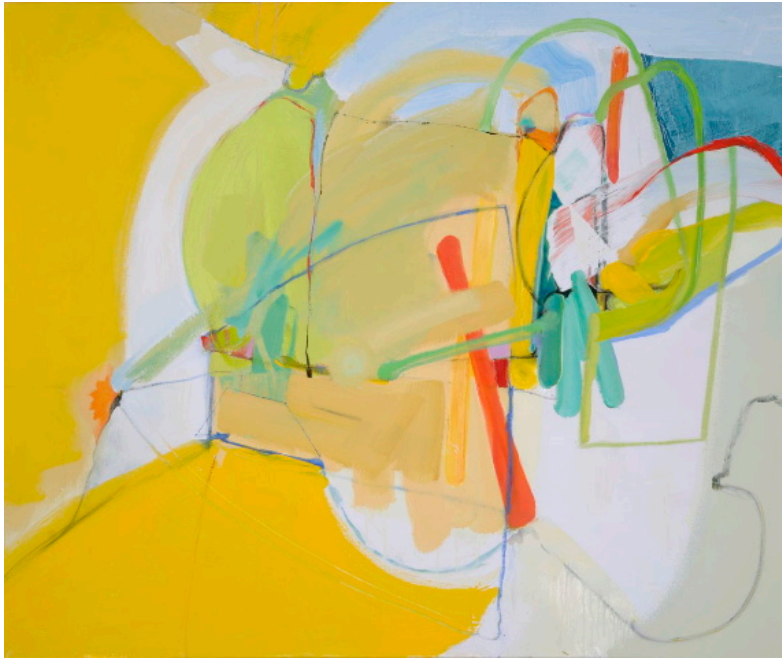
“On the Pond” by Barbara Groot, 2012. Acrylic and pastel on canvas, 40 x 48 inches.