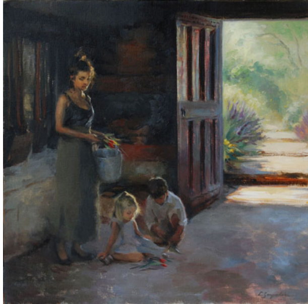
“The Potting Shed” by Lynn Sanguedolce, 2012. Oil, 20 x 20 inches.

GRENNING GALLERY - “Autumn Group Show” has an opening reception on Saturday from 5 to 7 p.m. The show runs through Nov 10. The gallery is located at 17 Washington St, Sag Harbor, NY. www.grenninggallery.com