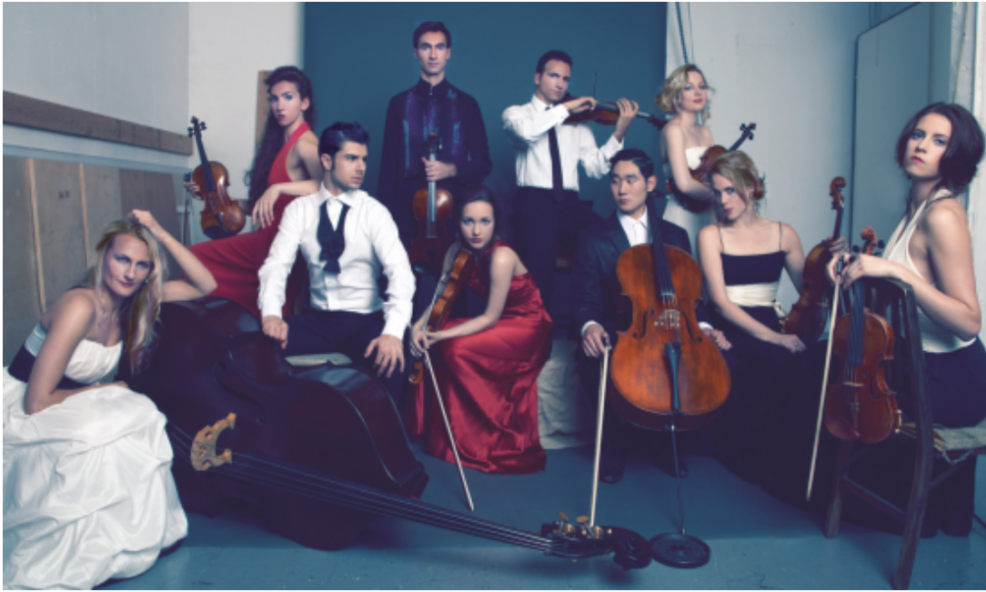
Salomé Chamber Orchestra.

▪ About Nova's Ark Project: Many people remark on Nova's "elliptical house," the surrounding sculptures and the small herd of sheep grazing in the shadow of the sculptures. Few realize that these sights are only a glimpse of the ninety-five acres of preserved countryside featuring huge steel sculptures set in open fields, as well as murals and interior sculptures.