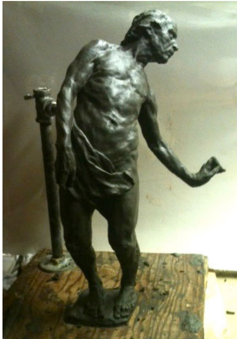
“Avarice” by Chad Fisher, 2012. 19 x 10 x 10 inches.