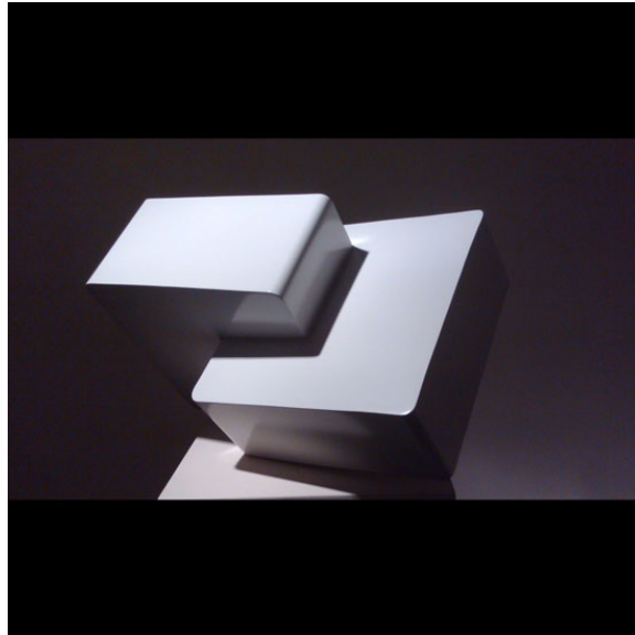
Artwork by Michael Chiarello.