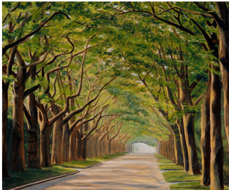
“Wyndanch Early Morning” by Eileen Skretch. Oil on wood, 30 x 36 inches.

SOUTHAMPTON HISTORICAL MUSEUM - “Southampton Landscapes by Eileen Dawn Skretch” has an opening reception on Saturday from 4 to 6 p.m. The show runs through Nov 3. The exhibition is located at the Rogers Mansion, 17 Meeting House Lane, Southampton NY. www.southamptonhistoricalmuseum.org