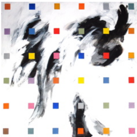
“Confetti” by Mike Zisser. Acrylic on canvas, 36 x 36 inches. Courtesy ArtSI.

This weekend presents the perfect chance for art gazing on Shelter Island. The Artists of Shelter Island (ArtSI) is holding its annual self-guided studio tour on Saturday and Sunday from 10 a.m. to 5 p.m. There are 17 studios presenting works that include painting, photography, sculpture, ceramics, digital art and printmaking. Admission is free.