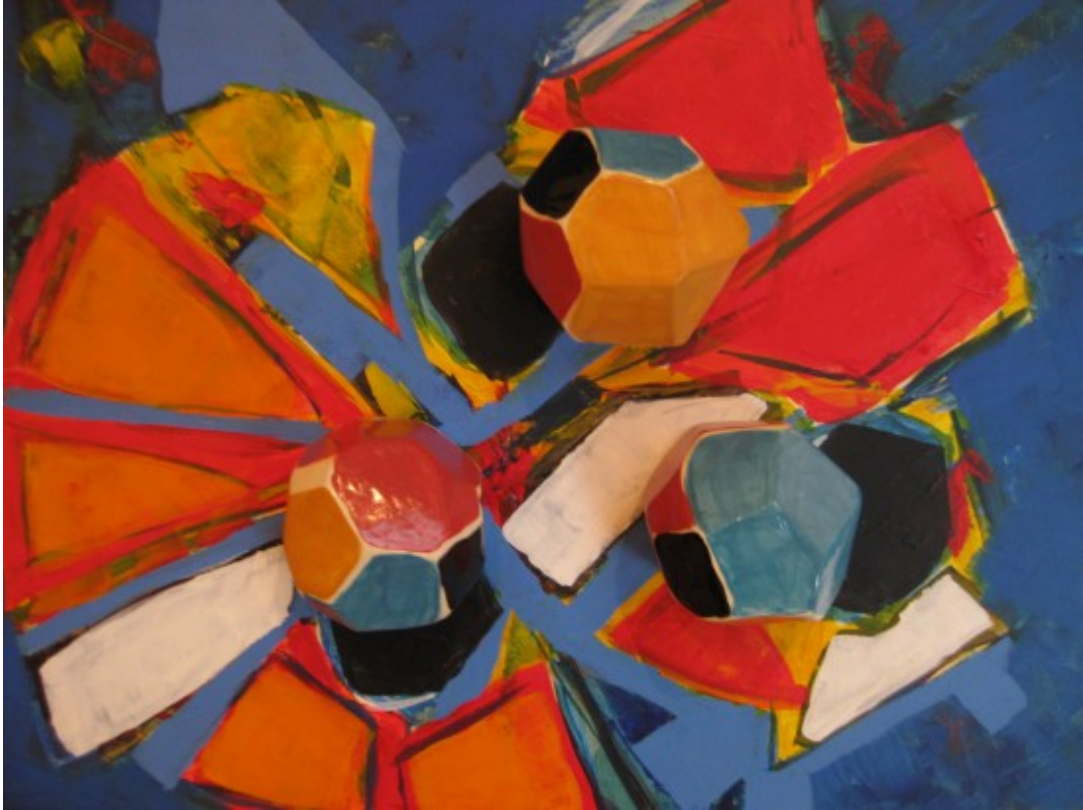
“New Journeys” by Karen Klaer, 2010. Acrylic painting with clay relief, 16 x 20 inches. Courtesy ArtSI.

“We envisioned consolidating an image for ourselves as an informal organization of dynamic arts professionals who happen to live on Shelter Island while highlighting Shelter Island as an exciting destination for the many art visitors who come to the East End of Long Island,” said Zisser.