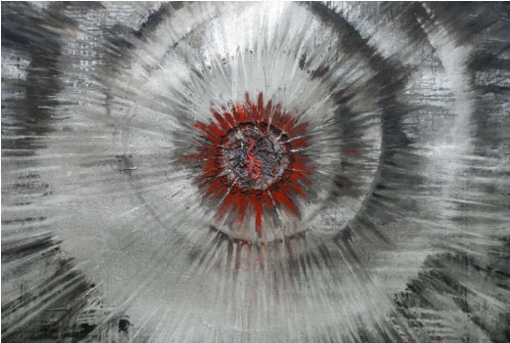
“Point of Entry” by Janet Culbertson. Oil, iridescent pigments, 22 x 30 inches.

Maps and a preview of the art on view can be found at www.artsi.info . A group exhibition is also on view at the Shelter Island Public Library. Following are a few works by artists who are opening their studio for the tour: