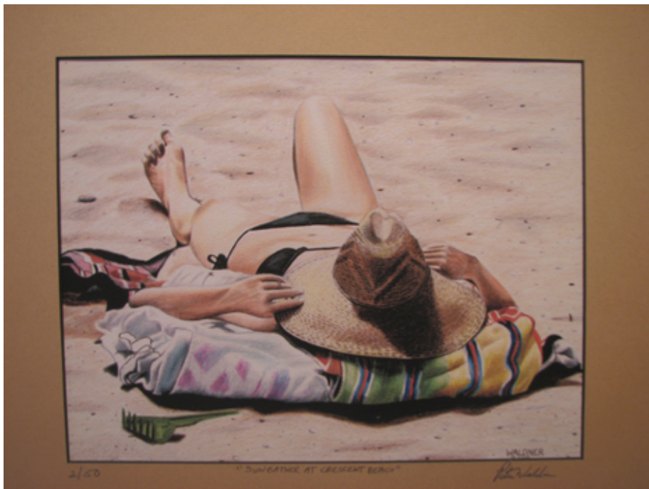
“Sunbather at Louis’ Beach” by Peter Waldner. Colored pencil, 14 x 18 inches.

Maps and a preview of the art on view can be found at www.artsi.info . A group exhibition is also on view at the Shelter Island Public Library. Following are a few works by artists who are opening their studio for the tour: