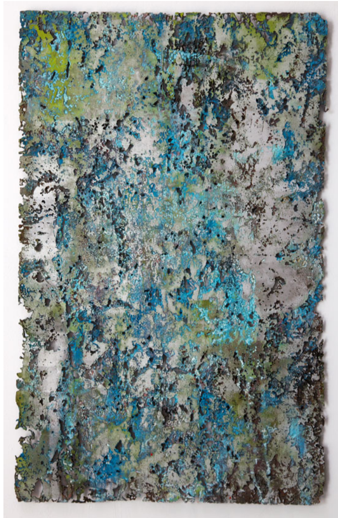
"Blue Waters" by Kia Pedersen. Oil on etched copper, 24 x 15 inches. Courtesy of the artist.

BASIC FACTS: The Artists of Shelter Island Open Studios Weekend is being held on Saturday and Sunday from 10 a.m. to 5 p.m. each day. Admission is free. For details, visit www.artsi.info .