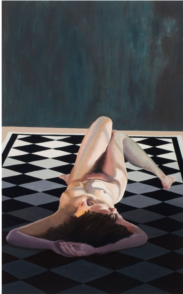
"Being on The Grid" by Harriet Sawyer. Oil on canvas, 48 x 30 inches.

The gallery is located at 90 Main Street, Sag Harbor, NY. www.rjdgallery.com