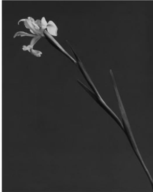
“Iris” by Robert Mapplethorpe, 1982. Silver Gelatin Print, 16 x 20 inches. Edition of 10.

“Bloom” remains on view through Sept 9. The Gallery Valentine Project Space is located at 2415 Main St, Bridgehampton, NY. www.galleryvalentine.com .