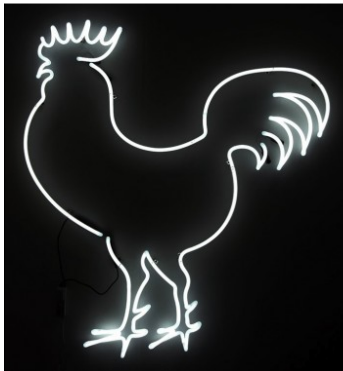
"Big White Cock" by Terence Koh, 2012. Edition of 3. Sculpture. Neon tubing and wires, 69 x 60 x 3 inches.

"Yes pleased" remains on view through Aug 12 at The Fireplace Project. The gallery is located at 851 Springs Fireplace Road, Springs, NY. www.thefireplaceproject.com .