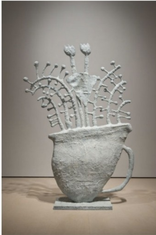
“Untitled (Flowers)” by Donald Baechler, 2009. Bronze, hand painted, 70.5 x 47 x 6 inches.

▪ “yes pleased” is exhibited at The Fireplace Project through Aug 12. The exhibition is a solo show by Terence Koh. This is the first time Koh is exhibiting in the Hamptons. All of the exhibited work is new.