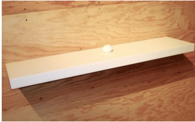
“my family ate my son knot knowing about truth” by Terence Koh, 2012. Unique sculpture. Thassos marble and eggshell, 2 x 43.25 x 10.25 inches.