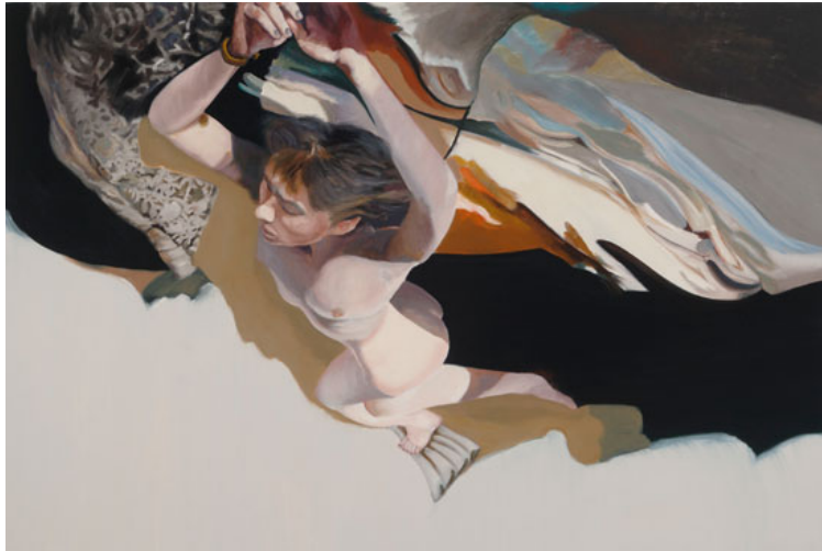
"Come Fly" by Harriet Sawyer. Oil on canvas, 40 x 60 inches.

© 2012 Pat Rogers and Hamptons Art Hub. All rights reserved.