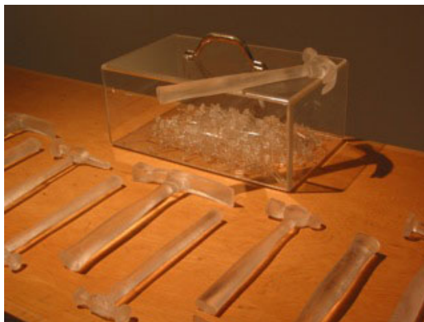
"Clear Tooling" by Nobuho Nagasawa.

© 2013 Hamptons Art Hub LLC. All rights reserved. Text excerpts and links may be used, provided that full and clear credit is given to HamptonsArtHub.com with appropriate and specific direction to the original content.