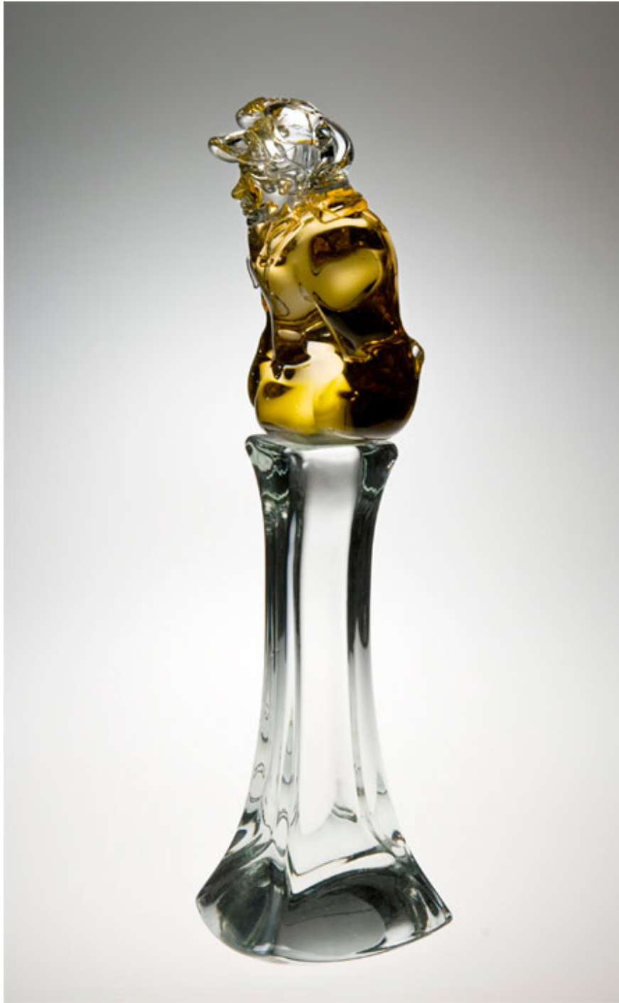
Artwork by Lorin Silverman.