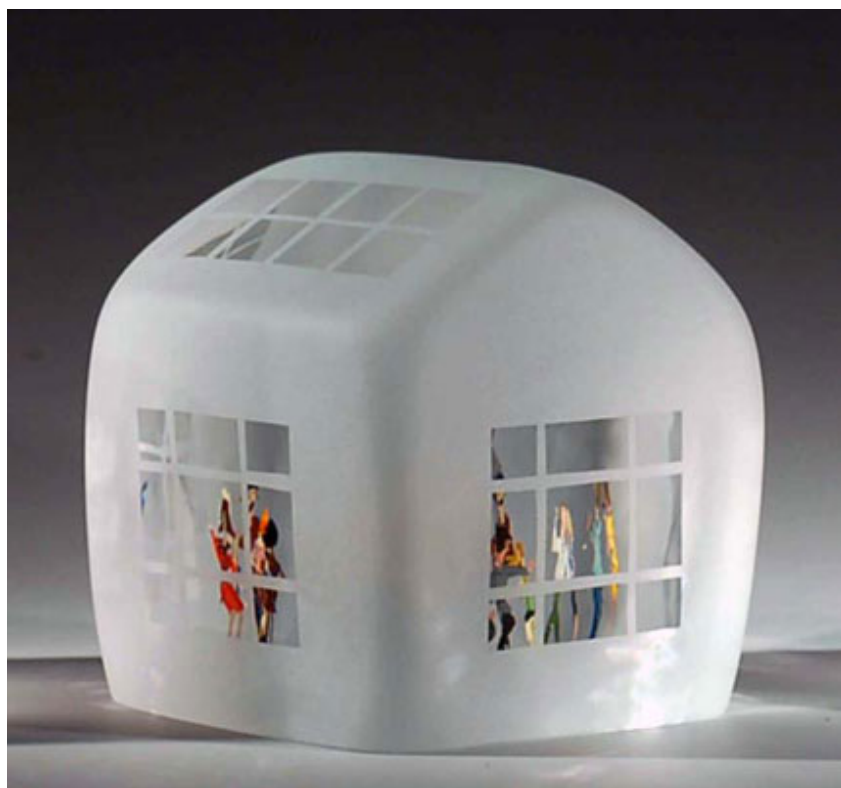
"Small Dance Party" by Alison Ruzsa, 2012. 4 x 3.75 x 4 inches.

goal is to energize and educate the public about studio glass art, and we're thankful to be celebrating this art medium's first 50 years."