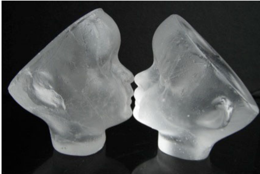
Glass art by Lindsey Jochets.