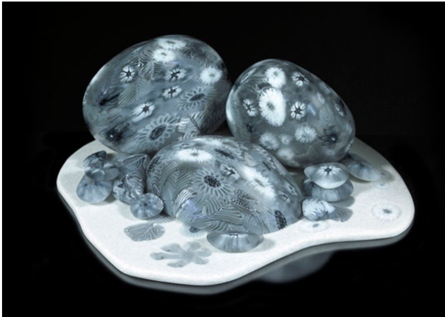
"Silent River Silver Garden" by Martie Negri.