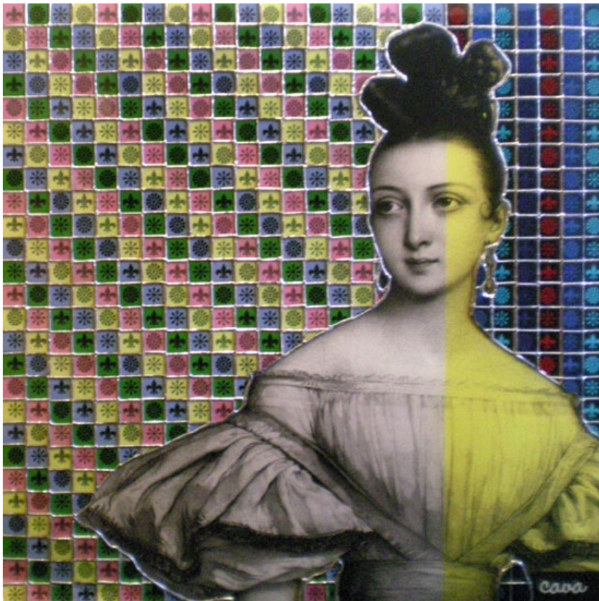
"Millie Plessis" by Joseph Cavalieri, 2011. Print, glass, solder, steel frame set into a wall hung light box, 40 x 40 x 3 inches.