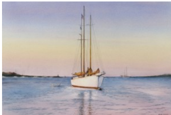
"Harbor Sunset" by Brooke Laughlin, 2012. Watercolor on paper.

PETER MARCELLE GALLERY - "Brooke Laughlin and Paige Peterson" has an opening reception on Sat from 6 to 8 p.m. The show runs through Aug 5. The gallery is located at 2411 Main St, Bridgehampton, NY. www.petermarcellecontemporary.com