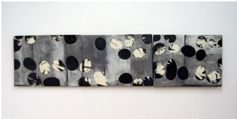
"Tumble" by Kathy Erteman. Monoprint on ceramic tablets, 52 x 16 x .5 inches.